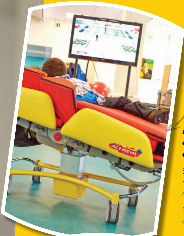
Side lying with optional support pack

Acheevas use Symmetrisleep positioning elements to provide support in supine, prone or side lying.