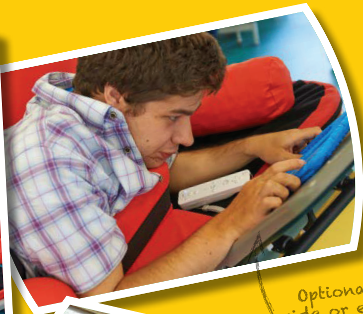
Optional side or end tables