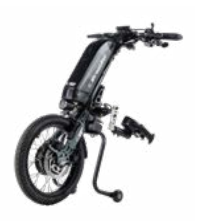
Color Kit anodized (stand, central section, One-Touch-Clamps)