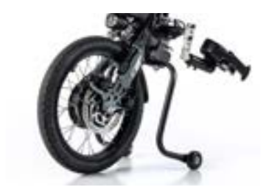
// STE060025 Mechanical double disc brake