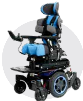
Zippie Q300M Mini