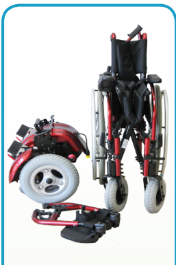
COMPACT & FOLDABLE