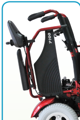
FLIP BACK ARMRESTS