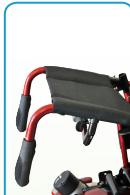
HALF FOLDING BACKREST