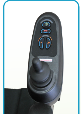
USER FRIENDLY ELECTRONICS