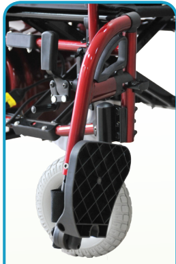
S/A DETACHABLE FOOTREST