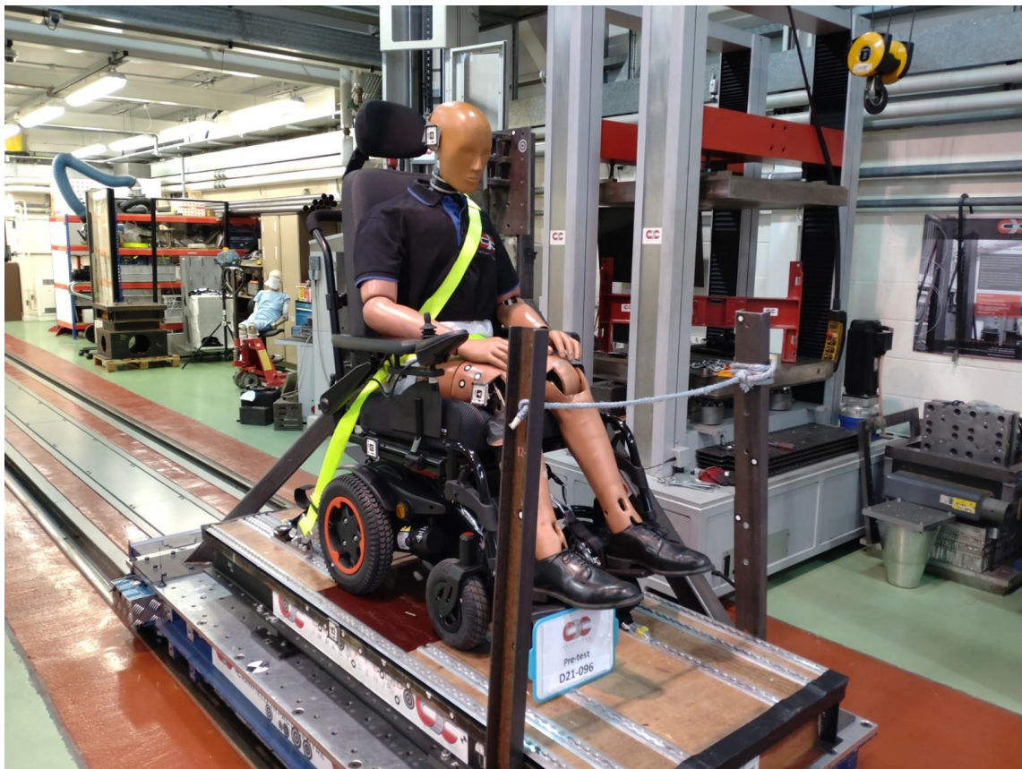
Figure 2: Front ¾ view, pre-test

// CIC IS A LEADER IN THE FIELD OF IMPACT AND SAFETY OF STRUCTURES