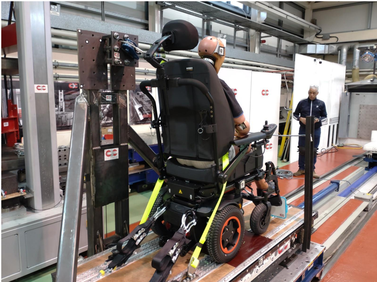
Figure 4: Rear ¾ view, pre-test

// CIC IS A LEADER IN THE FIELD OF IMPACT AND SAFETY OF STRUCTURES