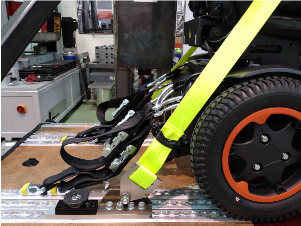
Figure 15: Rear tie-downs, post-test