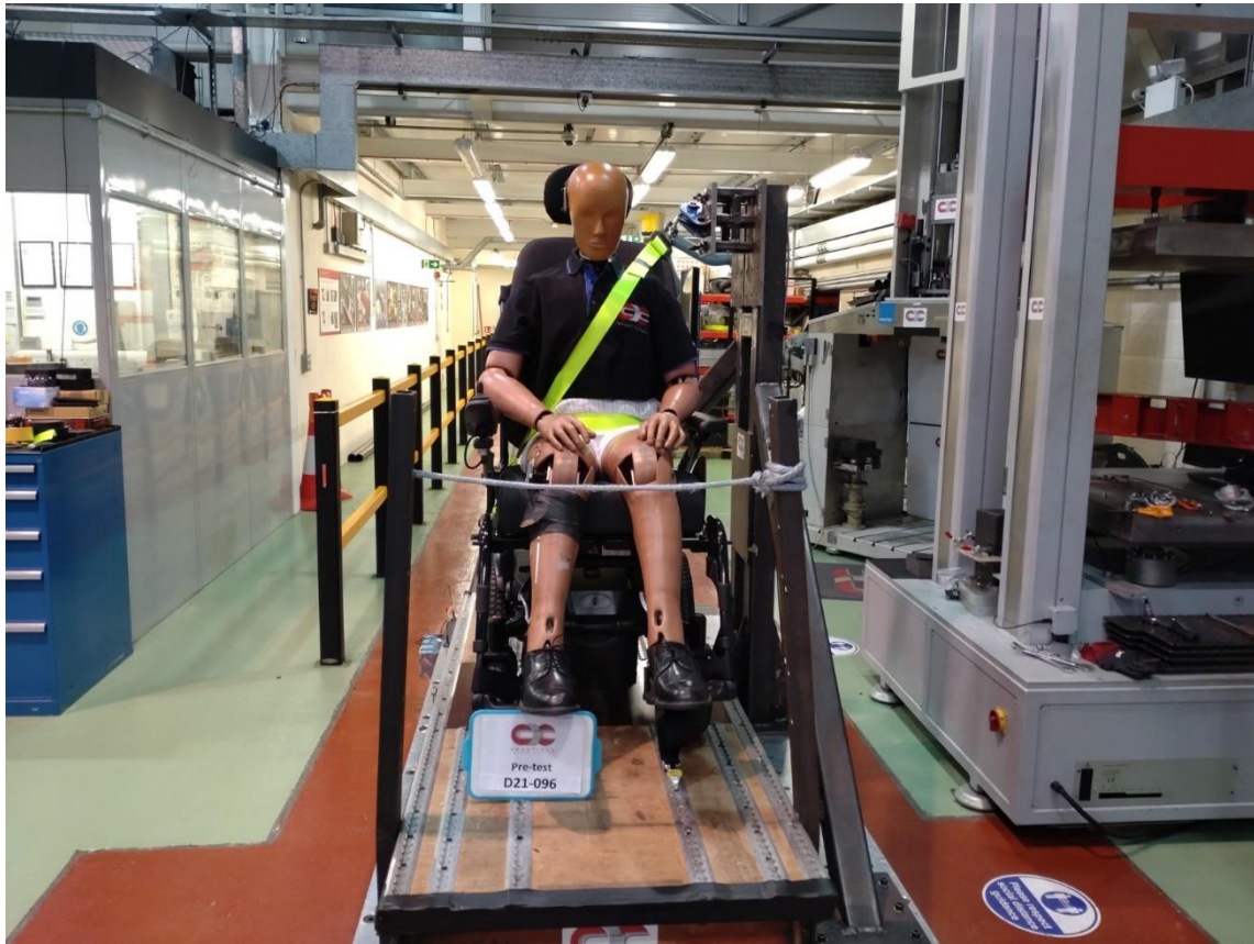
Figure 1: Front view, pre-test