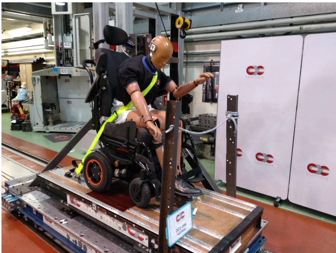
Figure 10: Front 3/4 view, post-test