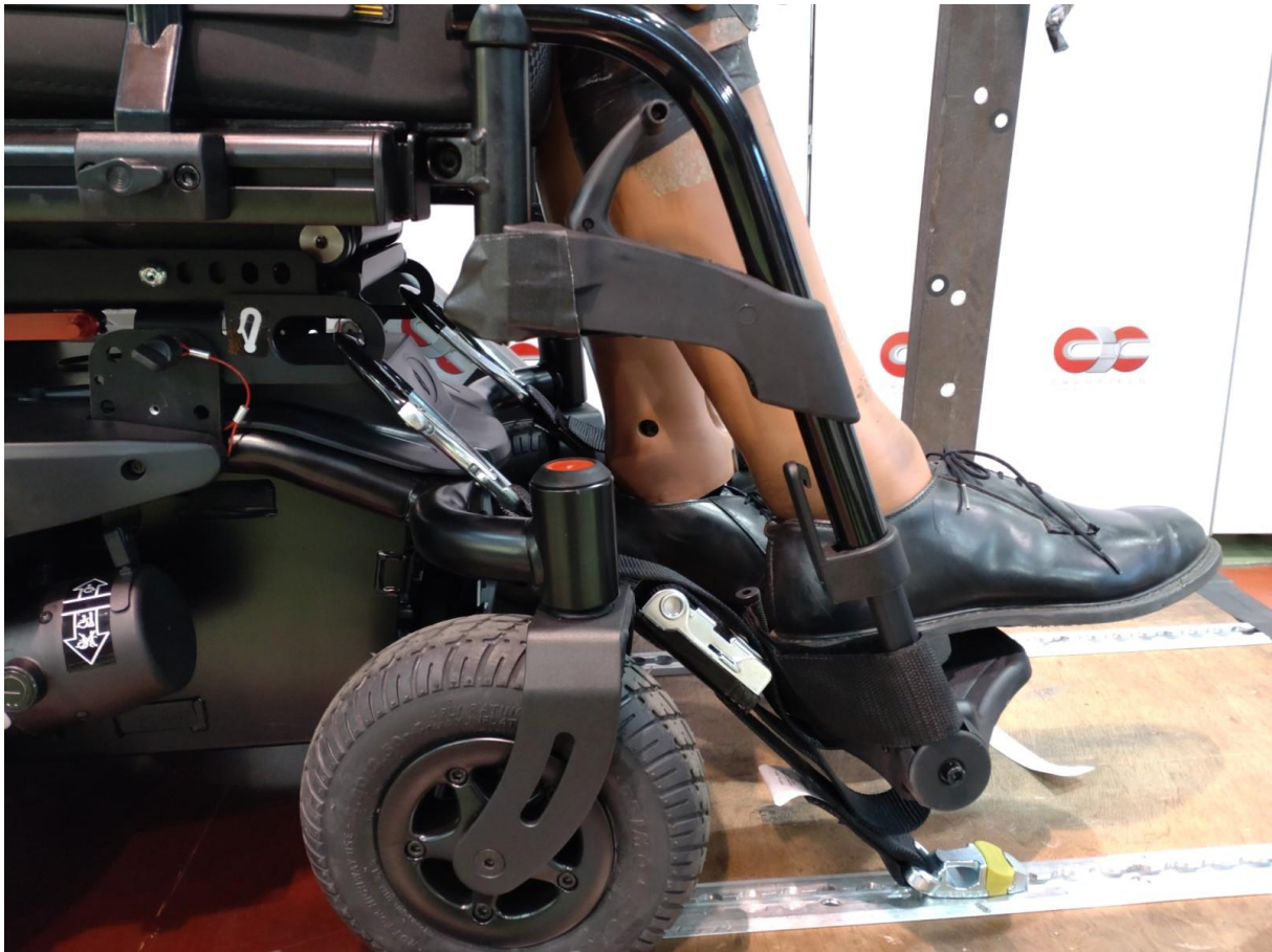
Figure 16: Front tie-downs, post-test

// CIC IS A LEADER IN THE FIELD OF IMPACT AND SAFETY OF STRUCTURES