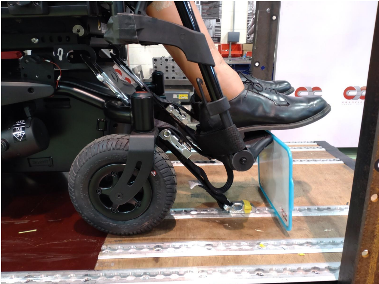
Figure 8: Front tie-downs, pre-test

// CIC IS A LEADER IN THE FIELD OF IMPACT AND SAFETY OF STRUCTURES