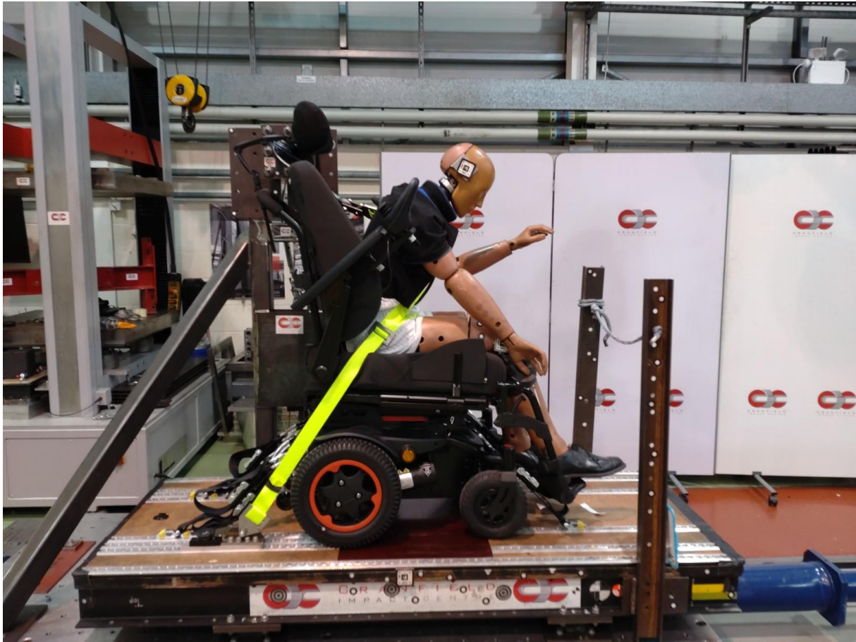
Figure 11: Side view, post-test