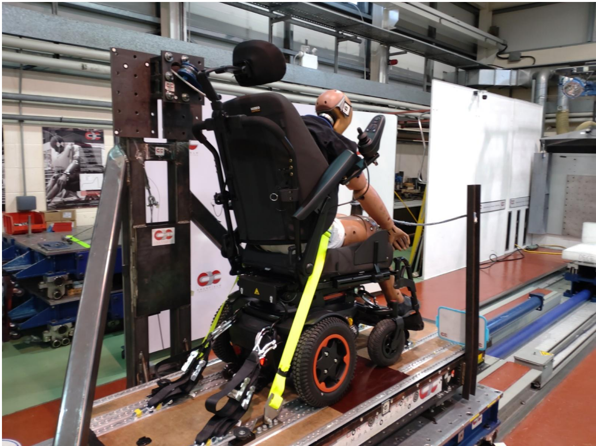
Figure 12: Rear ¾ view, post-test

// CIC IS A LEADER IN THE FIELD OF IMPACT AND SAFETY OF STRUCTURES