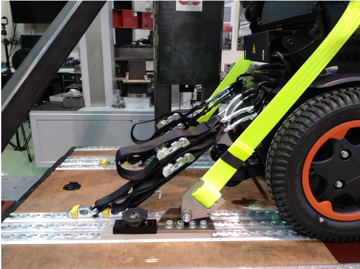
Figure 7: Rear tie-downs, pre-test