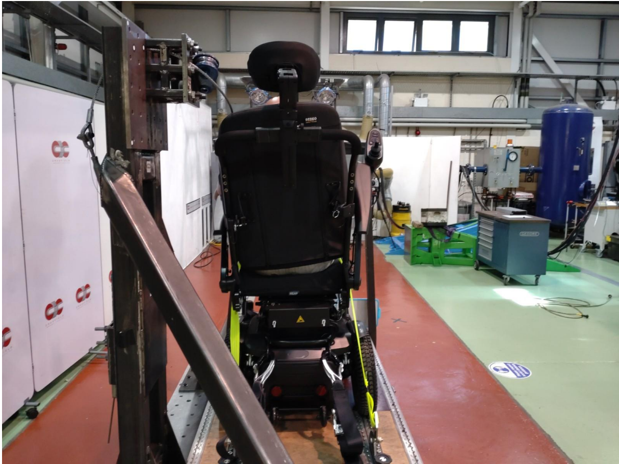
Figure 13: Rear view, post-test