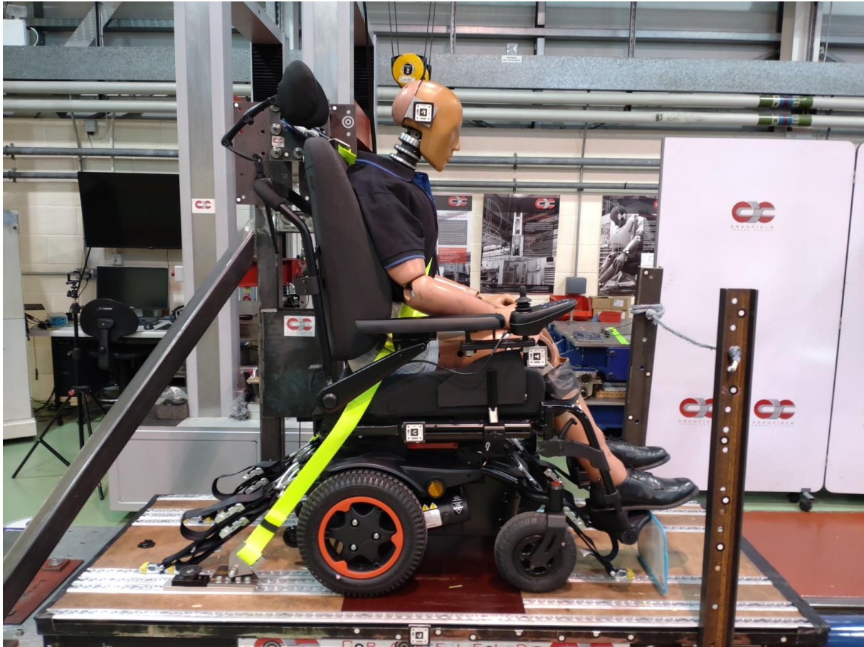
Figure 3: Side view, pre-test