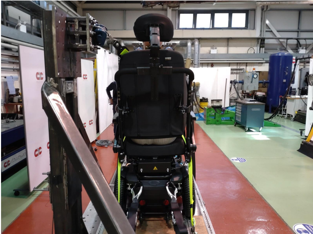
Figure 5: Rear view, pre-test