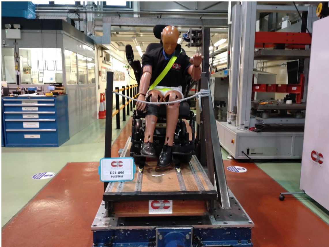
Figure 9: Front view, post-test