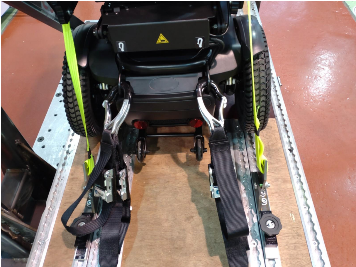
Figure 14: Rear tie-downs, post-test