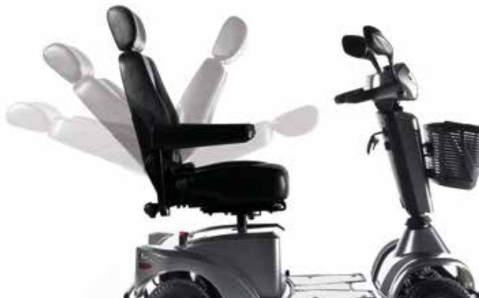
→ Quick backrest angle adjustment