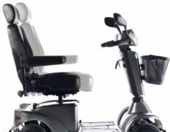
→ Infinite seat depth adjustable

The S-SERIES advanced seating solution, takes comfort to the highest level, from the seat height, depth and recline adjustments, to the flip up, width, angle and depth adjustable comfort armrests – every feature has been designed for comfort – for you.