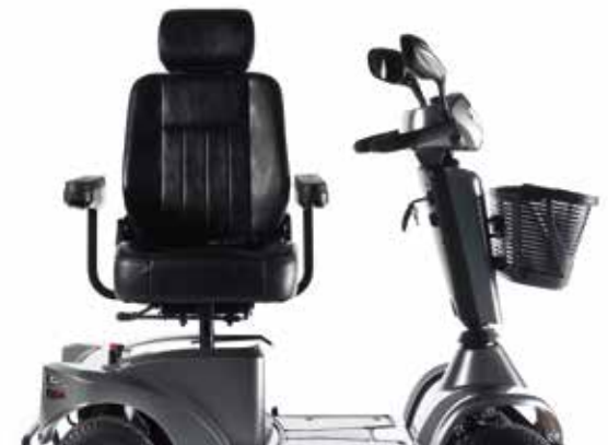
→ Seat rotation enables comfortable transfers