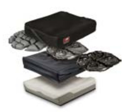
Balance® with Cryo™ Technology & Air Insert & Flow Fluid Up to 226 kg

To learn more about our JAY cushions, visit the JAY product page on www.SunriseMedical.com.