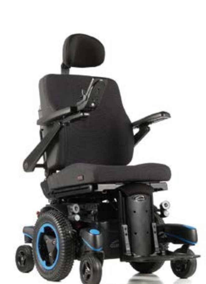
Q700 M HD with SEDEO PRO

MOBILITY IS NOT A MATTER OF SIZE - UNLIMITED MOBILITY YOU CAN TRUST