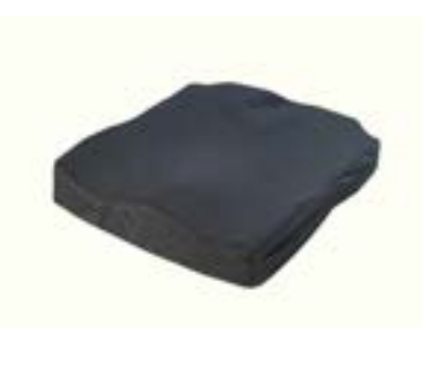
Easy Visco® Up to 226 kg