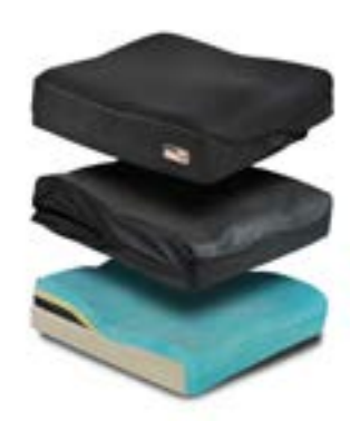
Union® (available for the UK Market only) Up to 226 kg