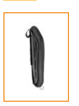
Shallow Contour Moderate lateral support