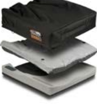
J2<sup>®</sup> & J2<sup>®</sup> DC Up to 226 kg