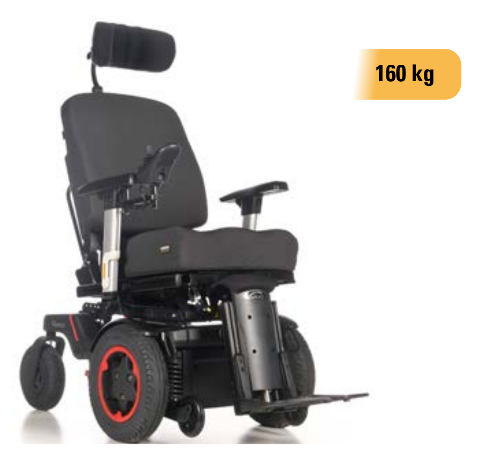
Q500 F with SEDEO PRO