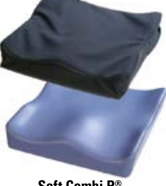
Soft Combi P® Up to 226 kg