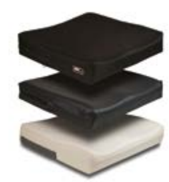
(available for the UK Market only) Up to 226 kg