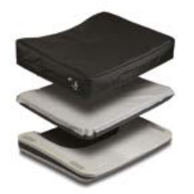
J2® Plus Up to 294 kg