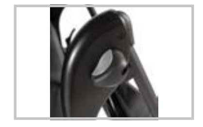
Improved ELR for better functionality and look.