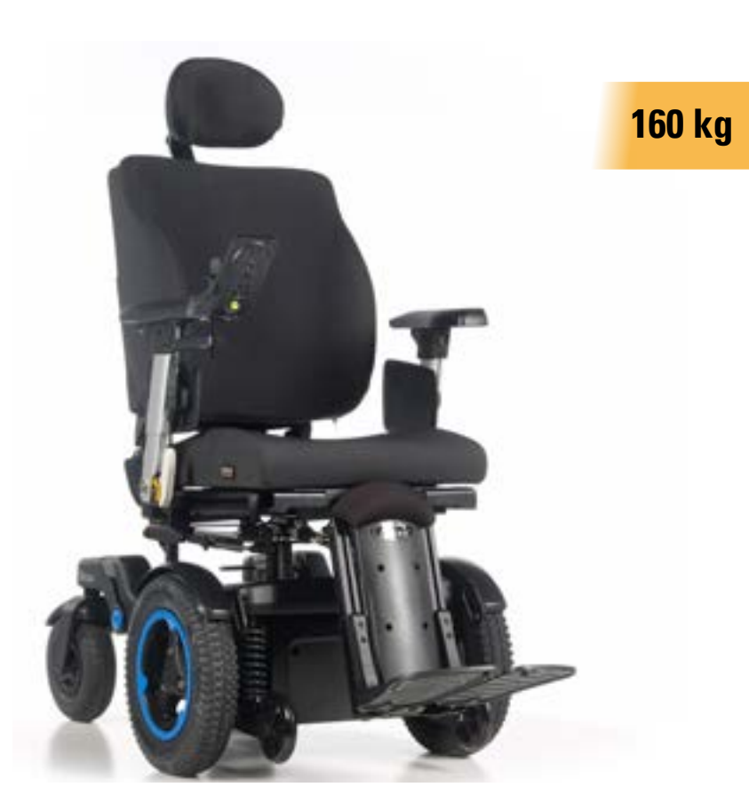
Q700 F with SEDEO PRO