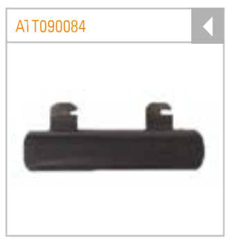
// Additional weight, removable, 5 kg, to increase traction