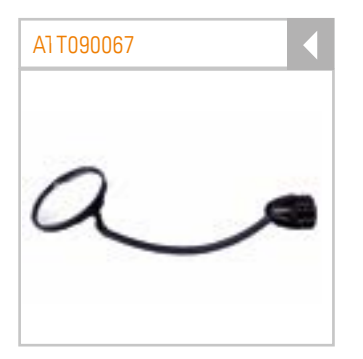
// Rear view mirror