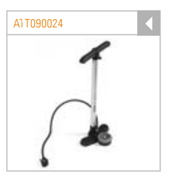
// High pressure pump (0 - 11 bar)