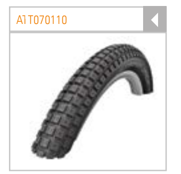
// Tyre, pneumatic, tread, Mountainbike