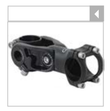
// S'em, multiadjustable