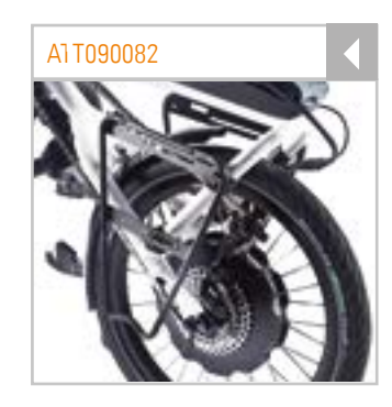
// Low rider carrier for saddle bags