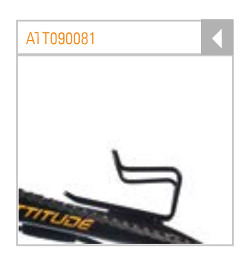
// Bottle holder