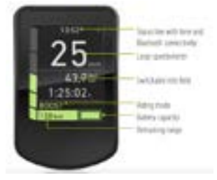
// Ccnnect Display ccnnects with your smartphone (download of neodrives app necessary) Records trip data such as average speed, maximum speed, trip distance, and total distance.