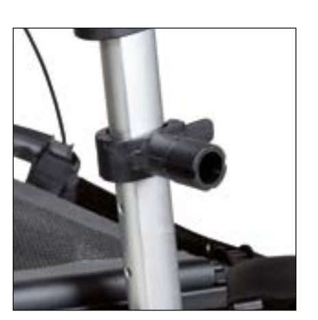
// UNIVERSAL BRACKET Suitable for fitting your choice of personal accessories.