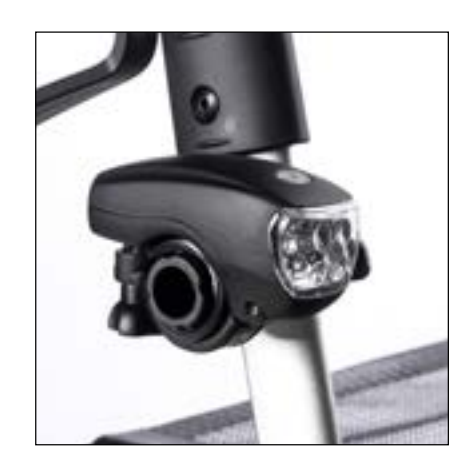
// LIGHT Ensures you're well visible in the dark - for additional safety.