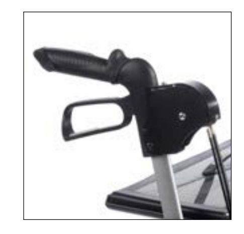
// ONE HAND BRAKE Comfortable and safe usage with one hand.