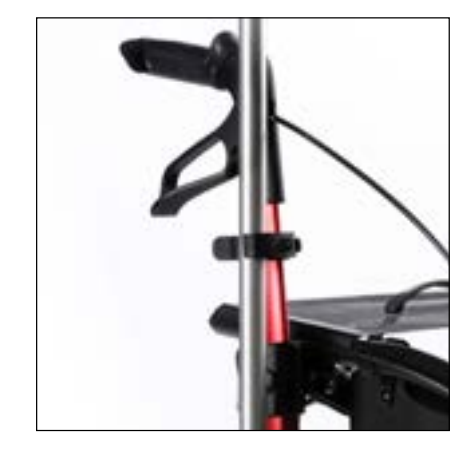
// CRUTCH HOLDER Keeps your crutch or walking cane securely fastened when walking. Easy to mount, easy to access.