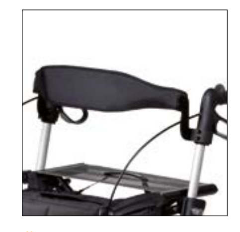
// BACK SUPPORT Provides you support to sit comfortably and safely when it's time to take a break. No need to remove when folding the rollator.