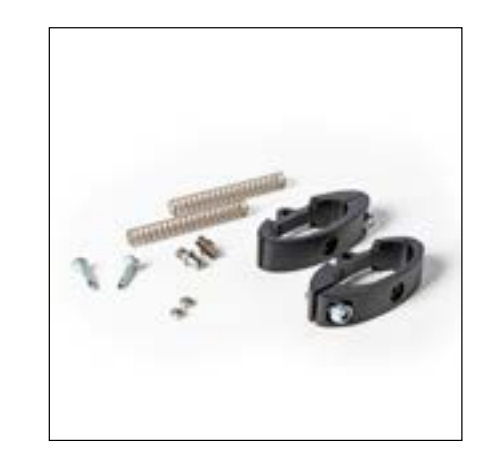
// REVERSE BRAKE KIT The rollator immediately stops moving when the brake is released.