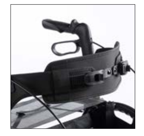
// ADJUSTABLE COMFORT BACK SUPPORT For additional comfort, choose this large, softly padded back support. Quick to adjust, easily folds with the