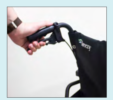
Attendant Control Drum Brake