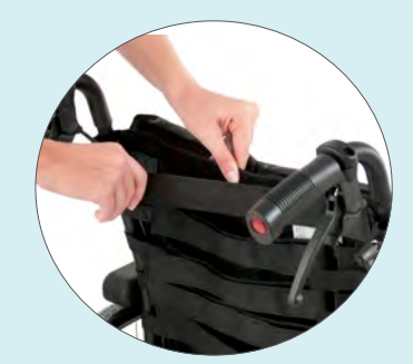
Tension adjustable backrest from 41cm to 46 cm.