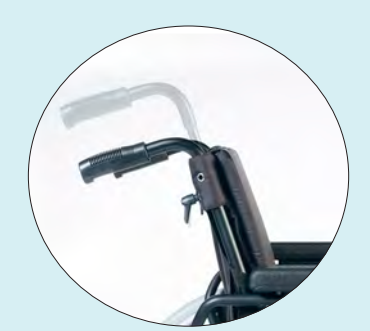
Height adjustable push handles