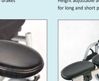
Height adjustable armrest with sliding pad for long and short position