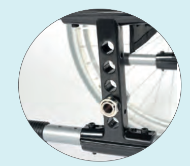
Frame Design includes seat depth adjustability (41 to 46 cm).