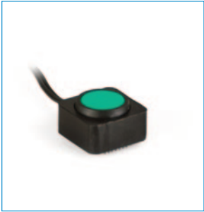
Mini 1 Button