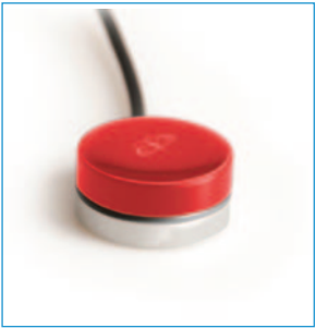
1" Single Switch