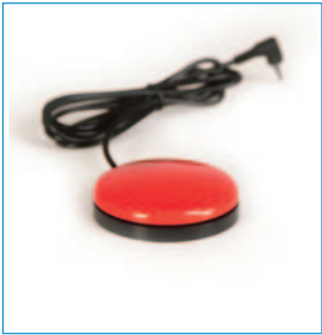
2.5" Single Switch

Individual remote switches for individual access. SWITCH-IT provides a number of different individual switches, which can be used as inputs for drive control systems or other functions.