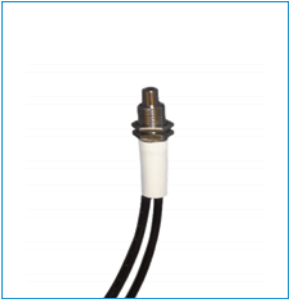
Fiber Optic Switch