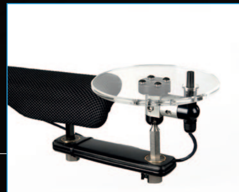
Mini Joystick on a SunDisk