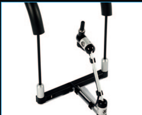
Mini Joystick on Chin Harness