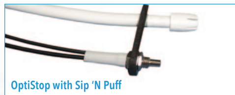
OptiStop with Sip 'N Puff