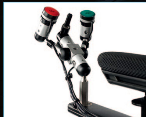
Mini Joystick with Extra Switches