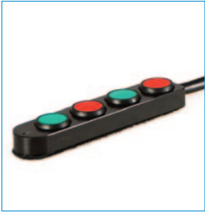
Mini 4 Button