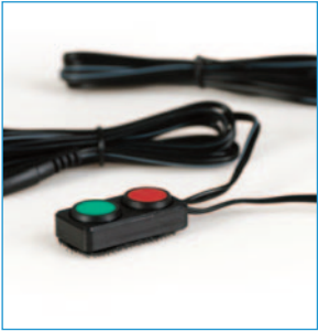
Mini 2 Button