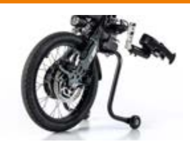
// STE060025 Mechanical double disc brake