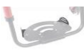
XFF050127 Adjustable side protection