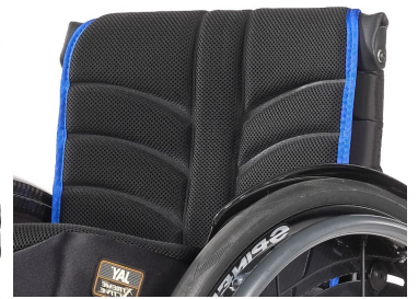
XFF 030317 EXO PRO backrest sling (EXO Evo version)