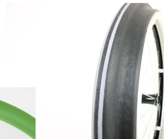
XFF070208 Handrims Maxgrepp