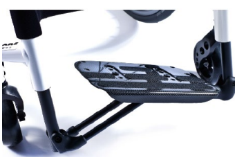
XFF050027 Footboard platform, lightweight, carbon fibre, auto folding