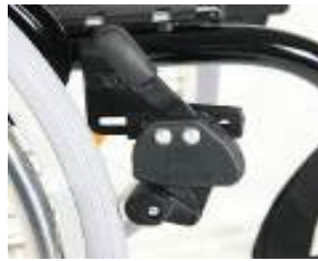
XFF060002 Knee lever brake