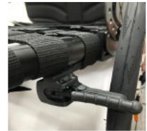
XFF060024 Lightweight compact brake EVO