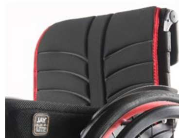
XFF 030316 EXO backrest sling (EXO Evo version)