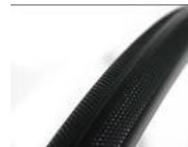
XFF070102 Tyre, puncture proof