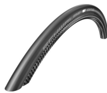
XFF070107 Schwalbe One