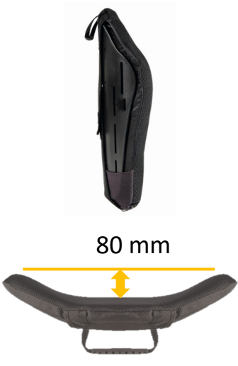
JAY J3 Mid Contour