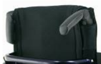
XFF 030203 Push handles, fold-down