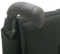
XFF 030201 Push handles long