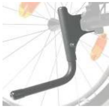
XFF090001 Tip assist