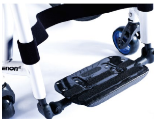
XFF050132 Footboard platform, lightweight, carbon