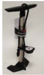
XFF090024 High pressure pump