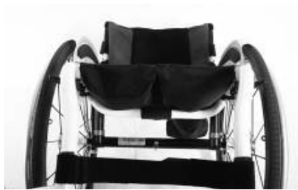
XFF 020003 Seat sling with utility bags 2