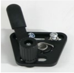
XFF060001 Standard brake