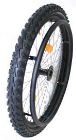
XFF07010 Mountainbike wheel