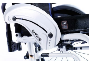
XFF040103 Aluminium, cold weather protection, fender