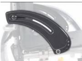
XFF040101 carbon fibre, cold weather protection, slim