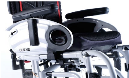
XFF04000x Desk sideguard, armpad, flip- up, removable