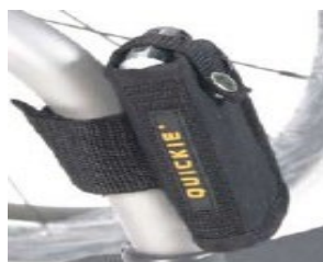
XFF090026 Mobile phone pocket