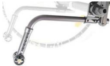
XFF090050 Anti-tip tubes, plug in, pair