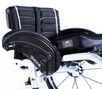
XFF040104 Carbon fibre, cold weather protection, fender