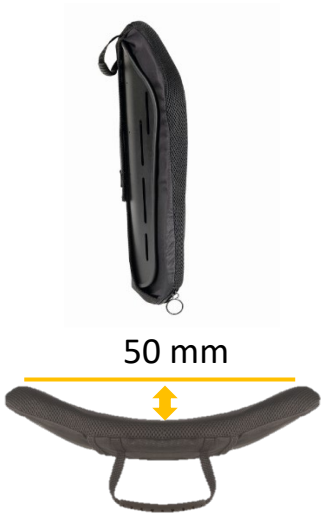
JAY J3 Shallow Contour