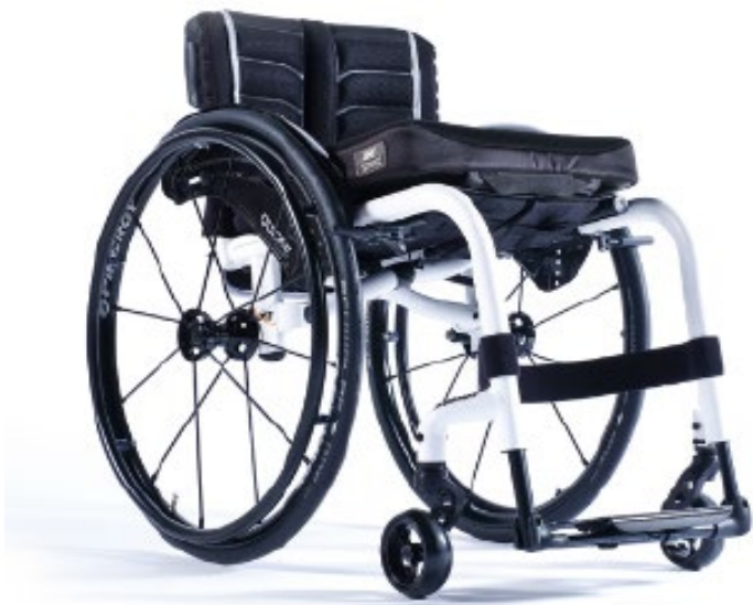
XFF010012 / 13 Open Frame