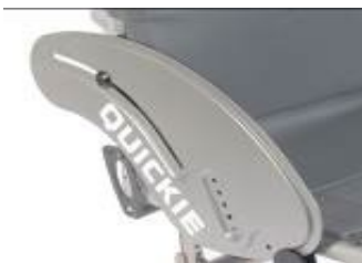
XFF040102 Aluminium, cold weather protection