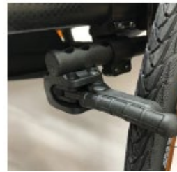
XFF060023 Compact brake EVO