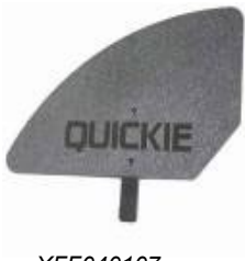
XFF040107 Composite sideguard detachable