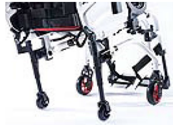
XFF090010 Transit wheels