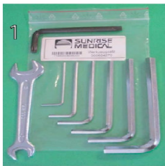
XFF090000 Tool kit