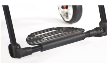
XFF050059 Footboard platform, performance