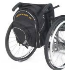
XFF090030 Back pack