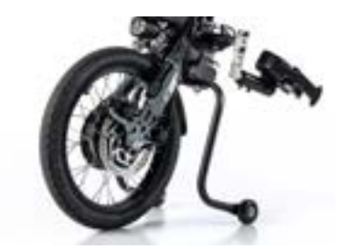
// STE060025 Mechanical double disc brake