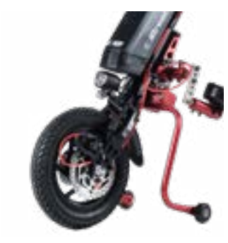
LED light, Carbon fender, discbrake