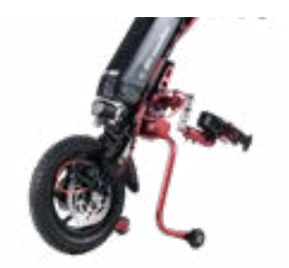
Stand, with wheels