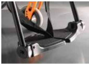
Divided footplate composite