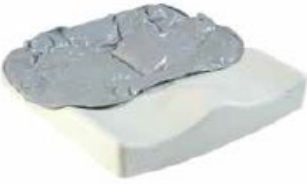
Jay Easy Fluid (picture shown without upholstery)