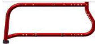
Life FF 85°