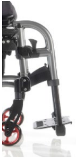
Aluminum hanger, 90°