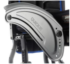
Sideguard alu with fender