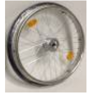
Drum brake wheel