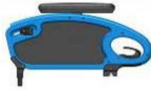
Desk armrest, fixed height, short armpad(25cm)