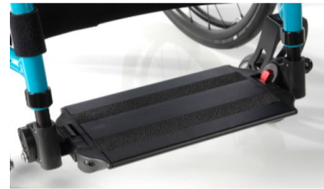
Platform, angle and depth adjustable; flip up, aluminium with locking system