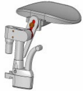
Amputee Support Pad