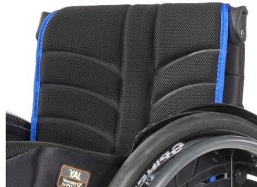
EXO PRO backrest sling (new EXO Evo version)