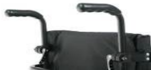
Height adjustable push handles