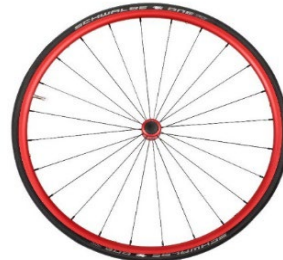
Lightweight wheel, anodized red