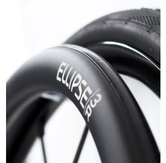
Ellipse 3R Handrim