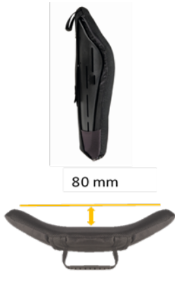
JAY J3 Back Mid Contour