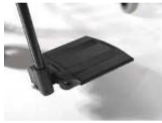
Divided footplate aluminum