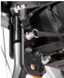
Backrest, angle-adjustable, lock when folded