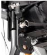
Backrest, angle-adjustable, lock when folded