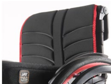
EXO backrest sling (new EXO Evo version)