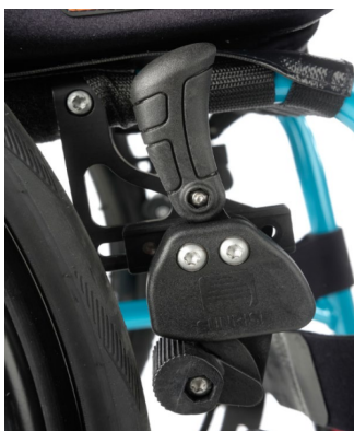
Knee lever wheel lock