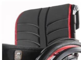
EXO backrest sling (new EXO Evo version)