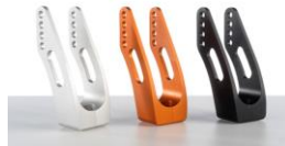
Fork Aluminium, black, orange & silver