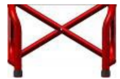
Frame FF 85° (integrated footrest), inset (20 mm on each side), active