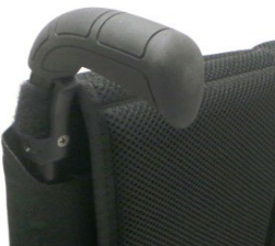
Push handles long