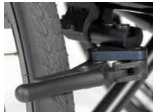
Compact wheel lock