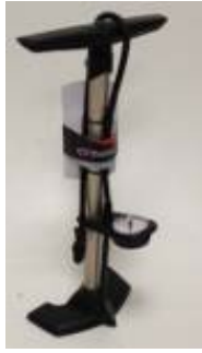
High pressure pump