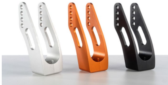
Fork Aluminium, black, orange & silver