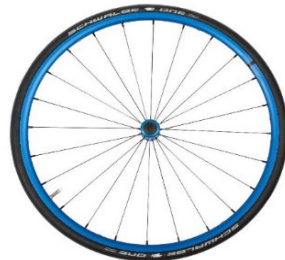
Lightweight wheel, anodized blue