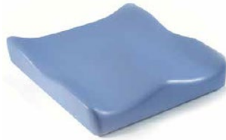
Jay Soft Combi P (picture shown without upholstery)