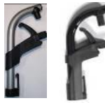
Hanger Angle 70°/80°