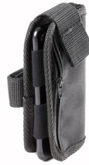
Mobile phone pocket