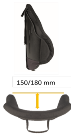
JAY J3 Back Mid Deep Contour