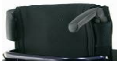
Fold down push