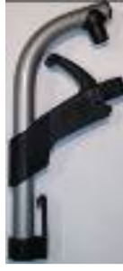
Hanger Angle 70°/80°