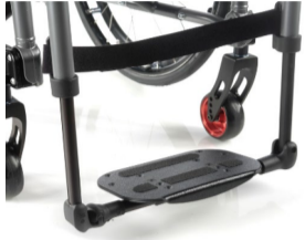
Platform footplate lightweight angle & depth adjustable composite flip up