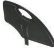
Sideguard composite detachable