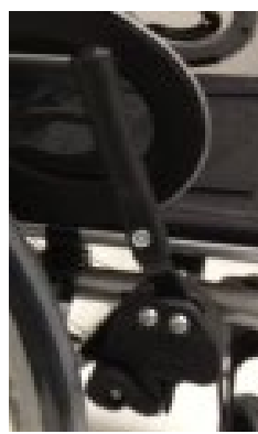
Brake lever extension