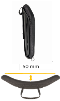
JAY J3 Back Shallow Contour