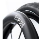
Ellipse 3R Handrim