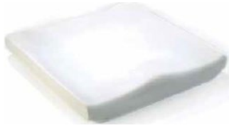
Jay Basic (picture shown without upholstery)