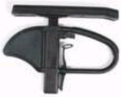
Single post height adjustable armrest