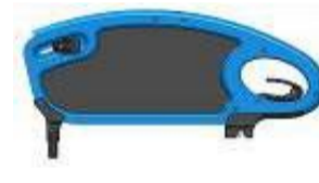
Desk armrest without armpad