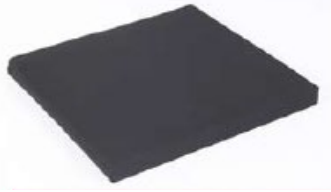
Seat cushion, cover with zipper, black