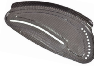
Sideguard carbon with fender