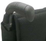
Push handles long