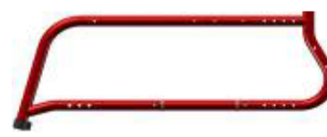
Life FF 75°