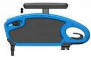
Desk armrest, height adjustable, short armpad(25cm)