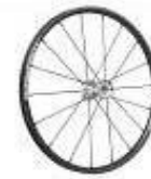
Spinergy wheel, 18 spokes