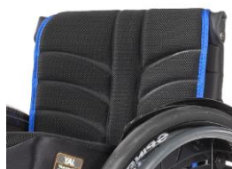
EXO PRO backrest sling (new EXO Evo version)