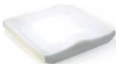
Jay Basic (picture shown without upholstery)