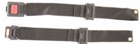
Lap belt with buckle, metal