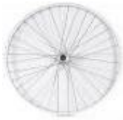
Universal cross spoked