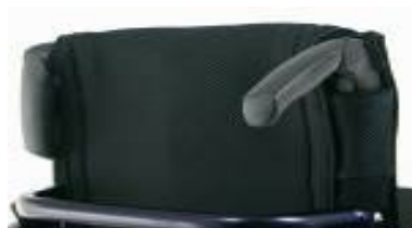
Fold down push