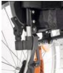
Angle adjustable back -12° to 12°