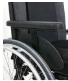
Single-post sideguard, depth adjustable, tool height-adjustable