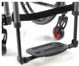
Platform footplate lightweight angle & depth adjustable composite flip up