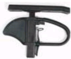
Single post height adjustable armrest