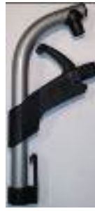
Composite hanger 70°/80°