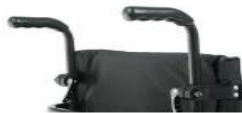
Height adjustable push handles