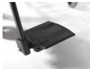
Divided footplate aluminum