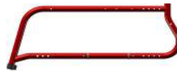
Life FF 75°