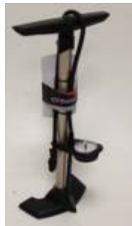
High pressure pump