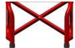
Frame FF 85° (integrated footrest), inset (20 mm on each