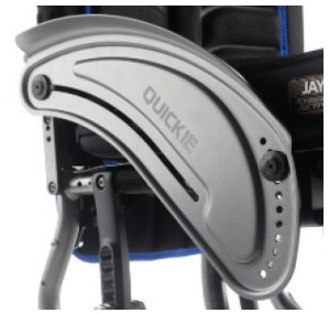
Sideguard alu with fender