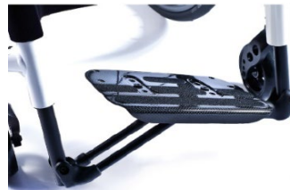
Footboard platform, lightweight, carbon fibre, auto folding