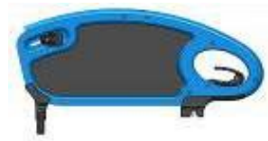
Desk armrest without armpad