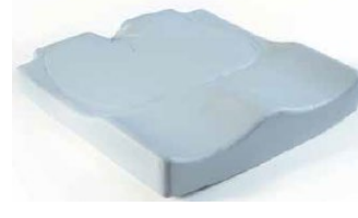
Jay Easy Visco (picture shown without upholstery)