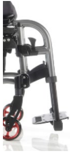
Aluminum hanger, 90°