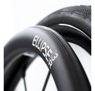
Ellipse 3R Handrim