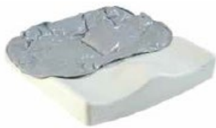
Jay Easy Fluid (picture shown without upholstery)