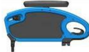
Desk armrest, fixed height, short armpad(25cm)