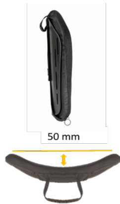
JAY J3 Back Shallow Contour