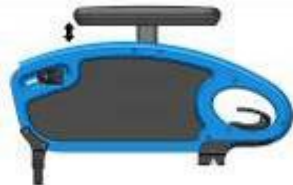
Desk armrest, height adjustable, short armpad(25cm)