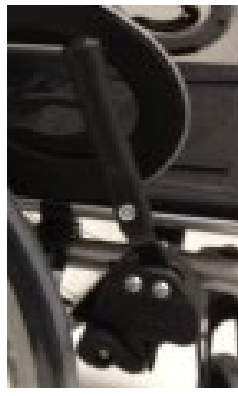
Brake lever extension