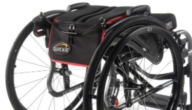
Backrest, fold down (to the front)