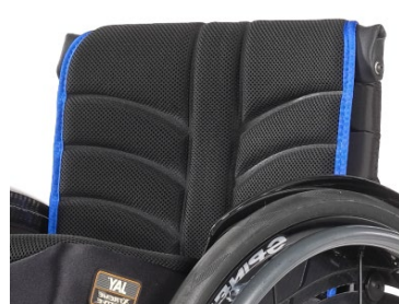
EXO PRO backrest sling (EXO Evo version)