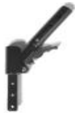
Backrest, Half Folding