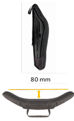
JAY J3 Back Mid Contour