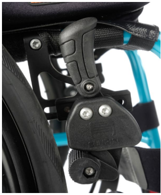
Knee lever wheel lock