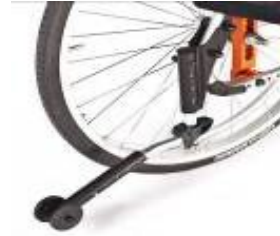
Anti-tip swing away