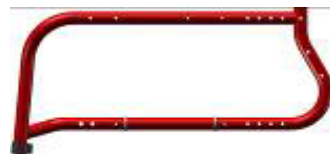
Life FF 85°