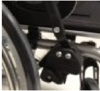
One arm wheel lock