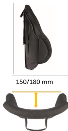
JAY J3 Back Mid Deep Contour