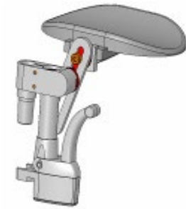
Amputee Support Pad