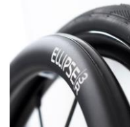
XFF070212 Handrims Ellipse 3R