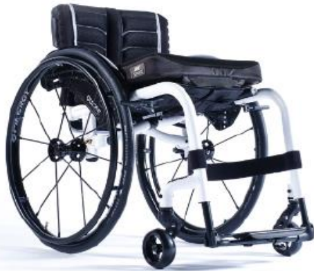
XFF010012 / 13 Open Frame