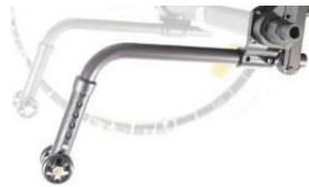
XFF090050 Anti-tip tubes, plug in, pair