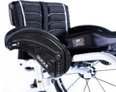
XFF040104 Carbon fibre, cold weather protection, fender