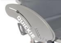
XFF040102 Aluminium, cold weather protection