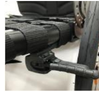
XFF060024 Lightweight compact brake EVO