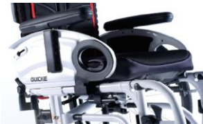
XFF04000x Desk sideguard, armrest, flip- up, removable