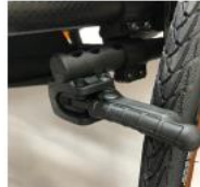
XFF060023 Compact brake EVO