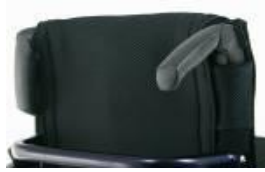
XFF 030203 Push handles, fold-down