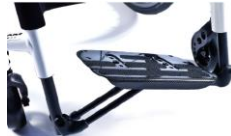
XFF050027 Footboard platform, lightweight, carbon fibre, auto folding