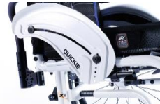
XFF040103 Aluminium, cold weather protection, fender