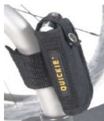
NSW090026 Mobile phone pocket