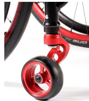
NSW080008 Castor fork, aluminum, one-arm, red