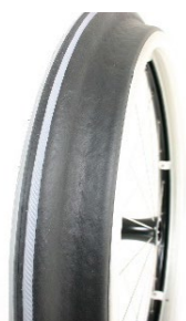
NSW070208 Handrims Maxgrepp