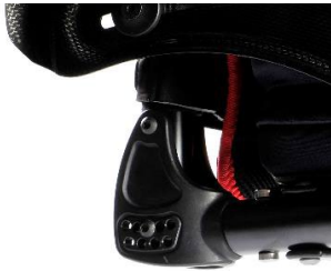
NSW030012 Backrest, angle adjustable