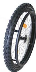
NSW070010 Mountainbike wheel