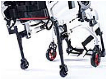
NSW090010 Transit wheels