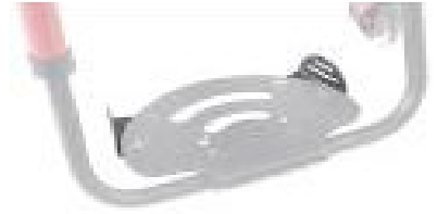
NSW050127 Adjustable side protection