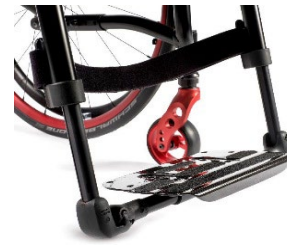
NSW050132 Footboard platform, lightweight, carbon fibre