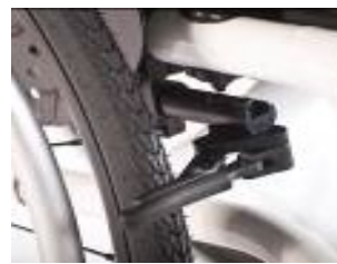
NSW060003 Compact brake