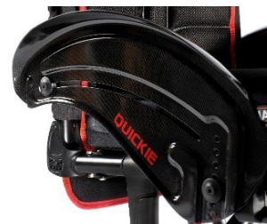
NSW040104 Carbon fibre, cold weather protection, fender