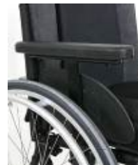
NSW040052 Single-post sideguard, armpad (33 cm)