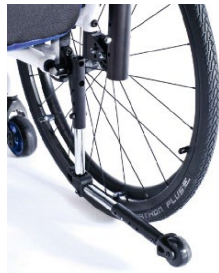
NSW090006 Anti-tip tubes, swing away