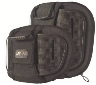
JAY J3 Carbon Back Shallow Contour