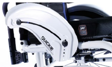
NSW040103 Aluminium, cold weather protection, fender