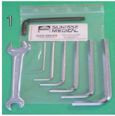
NSW090000 Tool kit