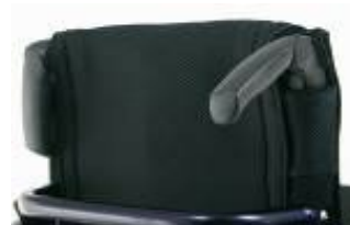
NSW030203 Push handles, fold-down