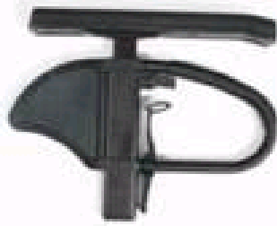
NSW040050 Single-post sideguard