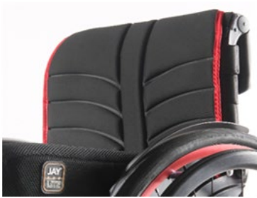
NSW030316 EXO backrest sling (new EXO Evo