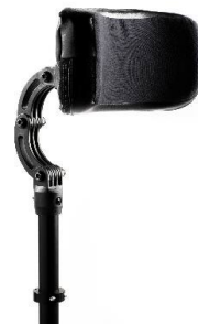
NSW030412 Headrest, medium