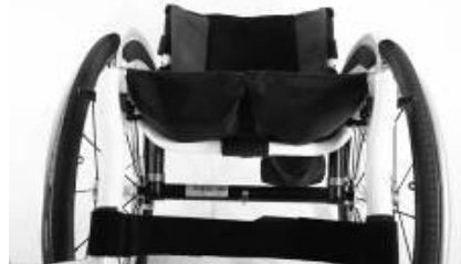
NSW020003 Seat sling with 2 utility bags