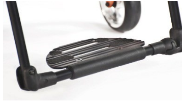
NSW050059 Footboard platform, Performance