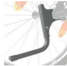
NSW090001 Tip assist