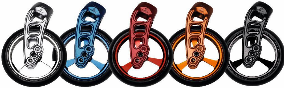
NSW080013 & NSW080306 Castor fork, Carbotecture & Castor solid (soft) aluminum