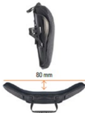
JAY J3 Back Mid Contour