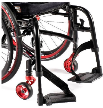
NSW050022 Footboard divided, aluminium, frame colour