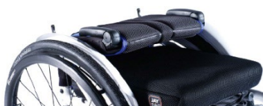
NSW030031 Backrest, fold-down