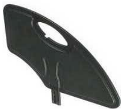
NSW040107 Sideguard, composite, removable (black)