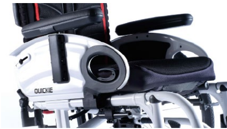
NSW04000x Desk sideguard, armpad, flip- up, removable