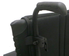
NSW030204 Push handles, height-adjustable