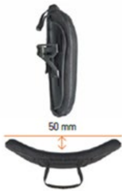
JAY J3 Back Shallow Contour