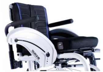
NSW040117 Tubular armrest, swing away, removable, padded