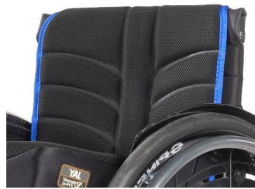
NSW030317 EXO PRO backrest sling (new EXO Evo version)