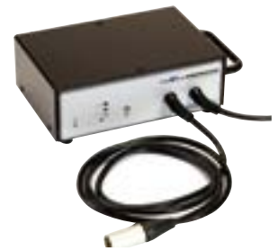
// QZT160103 & QZT160104