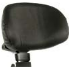
// QZT030430 & QZT030431