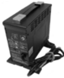
// QZT160100 & QZT160101