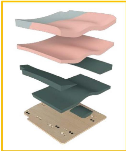
Old Support Memory Seat

This will be implemented from October 2021, with all sizes/variants switched over by January 2022.