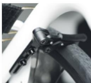
Old: 060004 lightweight compact wheel-lock