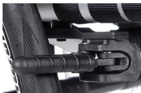
New: 060024 lightweight compact wheel-lock EVO

The lightweight compact EVO wheel-lock can also be ordered as a spare part: