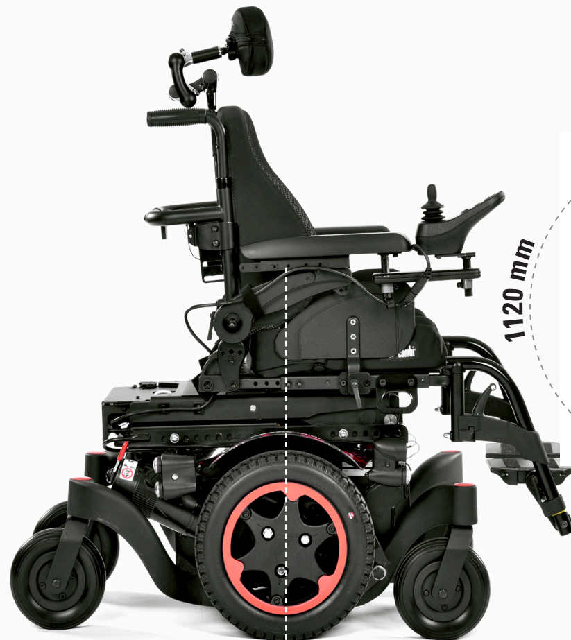
Mid-wheel drive technology

Looking for the most compact base for indoor manoeuvrability? Choose the 12" drive wheels, if you prefer better outdoor performance? Go for 14"!