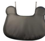
Padded Tray Cover