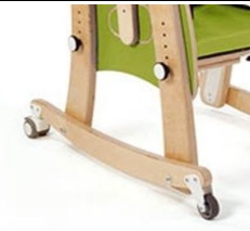
Skis with castors