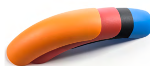
Colour-kit (mudguard) included in delivery