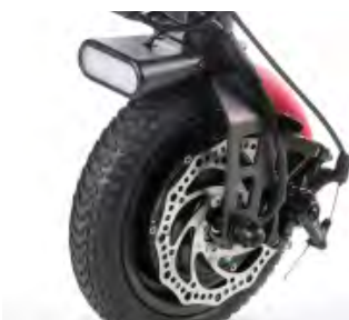
LED-light, Fender (accent colour red) and disc-brake (pictured on EMF070085 Drive wheel 8,5", solid tyre)