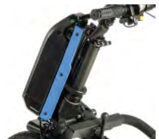
Colour-kit (sidebars) included in delivery (accent colour blue)