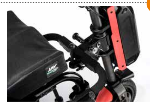
Step 4 - Lift the clamp to remove the play between the bike and the chair for a smoother ride

Once docked the F55 is light to push up, lifting the front castors off the ground. Ideal even with limited strength.