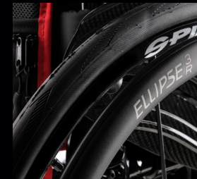
Handrims, Ellipse 3R, black