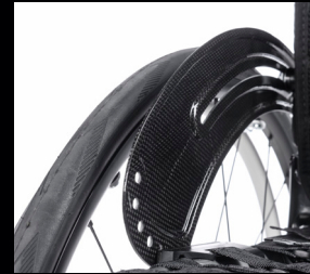
Slim style sideguard