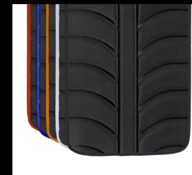
EXO PRO backrest sling