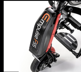
Empulse F55 bundling