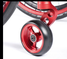
Castor fork, aluminum, one-arm

Use our online visualiser to create the QUICKIE Nitrum of your dreams!