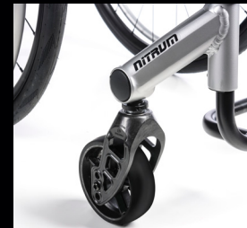
Castor fork, Carbotecture®