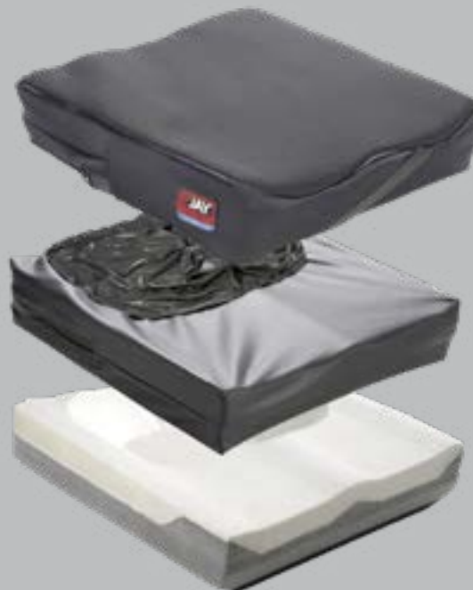
JAY Balance with Cryo Fluid

For convenience and protection, the JAY Balance features a dual-cover system. The innovative cover technology of an inner and outer cover balances the requirements of a good microclimate and an effective incontinence management. There are three different covers available: microclimatic, incontinence and stretch.