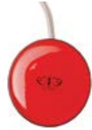
// QOP110526 - QOP110530