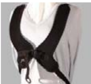
// JAY090040 - JAY090042