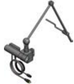
// QOP110485 // QOP110486