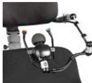
// QOP110487 // QOP110474