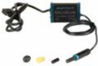
// QOP110470 // QOP110301