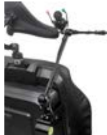
// QOP110483 // QOP110484