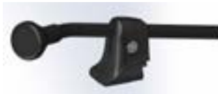
// QOP110534 - QOP110536