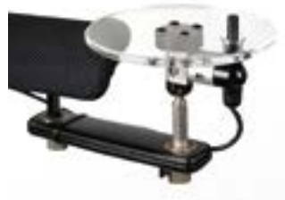
// QOP110353 // QOP110302 // QOP110362 // QOP110342