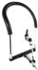
// QOP110480 // QOP110481 // QOP110470 // QOP110471