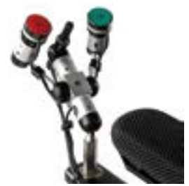
// QOP110353 // QOP110361 // QOP110524 // QOP110526 // QOP110560