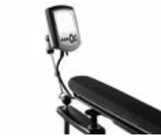
// QOP110353 // QOP110302 // QOP110362