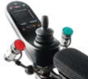
// QOP110560 // QOP110572 // QOP110013 // QOP110056 // QOP110529 // QOP110526