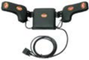
// QOP110401 - QOP110406