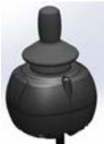
// QOP110475 // QOP110477 // QOP110307 // QOP110310