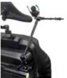
// QOP110485 // QOP110474