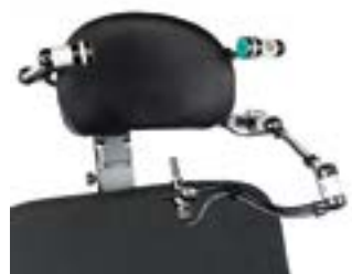
// QOP110487 // QOP110471 // QOP110526 // QOP110529 // QOP110561 // QOP110572 // QOP110571