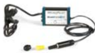
// QOP110471 // QOP110302