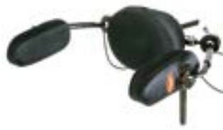
// QOP110370 // QOP110371