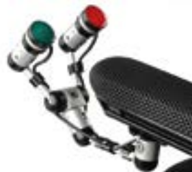
// QOP110566 // QOP110526 // QOP110529