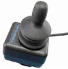
// QOP110472 // QOP110473 // QOP110304 // QOP110305