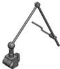
// QOP110483 // QOP110484