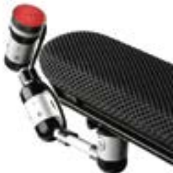
// QOP110526 // QOP110566