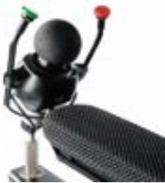
// QOP110353 // QOP110306 // QOP110362 // QOP110538 // QOP110539