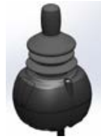
// QOP110306 - QOP110309 // QOP110474 - QOP110477