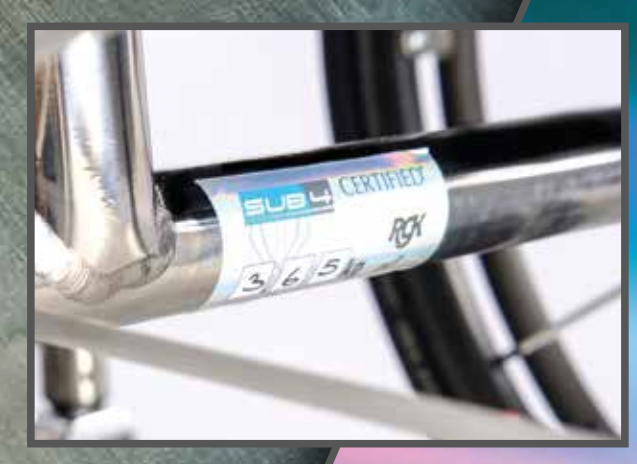
Sub4 technology – guaranteed under 4 kg*