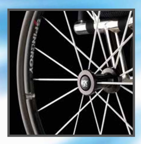
Single post axle