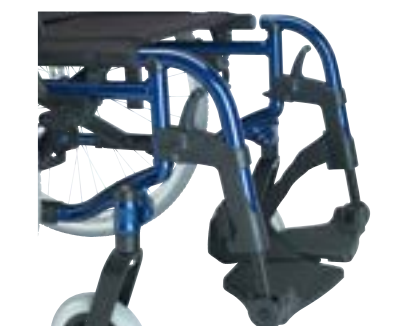
Compact frame: 80° hangers