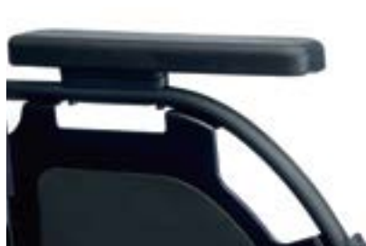
Armrest with armpad, tool height and depth adjustable