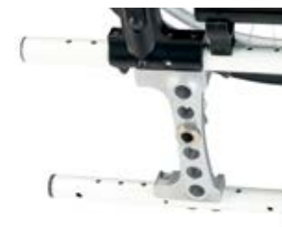
Aluminium axle plate with aluminium back tube receiver