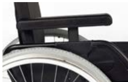
Armrest with armpad, height adjustable