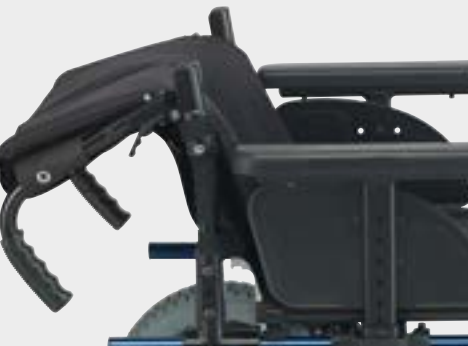
Half folding back