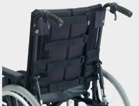
Tension adjustable back with 4 straps. Also available in Style X Ultra with 7 straps.

For more information about the complete range of options and accessories please check the Order Form.