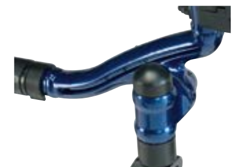
Innovative castor housing

The Style X and X Ultra chair incorporates many elements specifically though to increase rigidity. Like back tube and seat frame receivers, active seat rail fixation, two strong arm cross braces and the innovative castor house. All these parts are made of aluminium to provide strength and durability while keeping the chair lightweight.