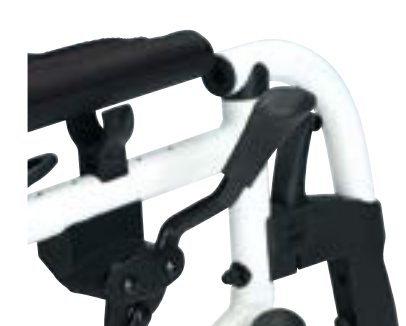
Seat frame receiver & active campling