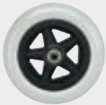
Castor solid 8" x 2"