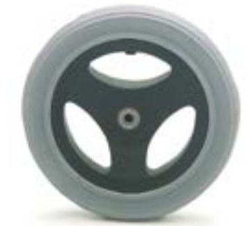
12" Rear wheels (pneumatic or solid)