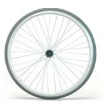
Different options in rear wheels: 22" or 24", with spokes, sport, pneuimatic, solid.