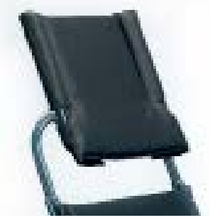
Fabric headrest for reclining backrest