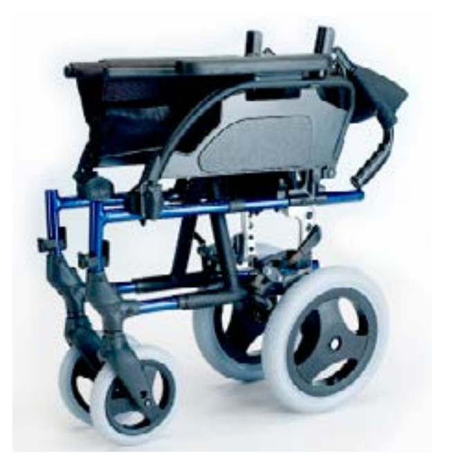
Breezy Style with half-folding backres, folded