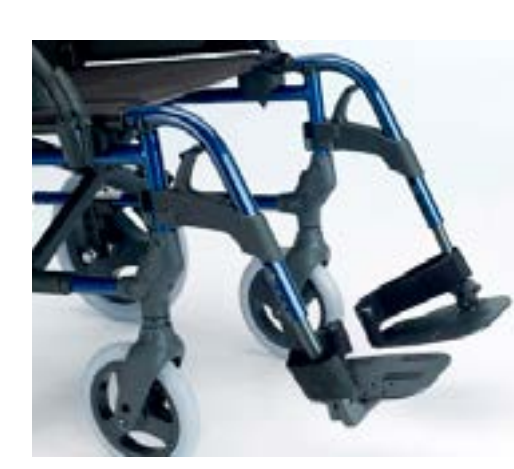
Aluminium angle adjustable footplates