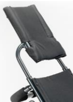
Upholstery recline headrest