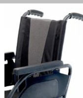
Breathable Vented upholstery