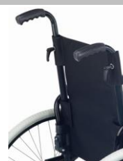
Height adjustable push handles