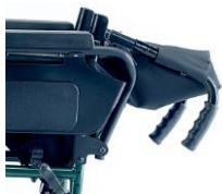
Half folding backrest