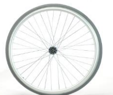
Spoke rear wheels