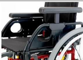
Height adjustable armrests