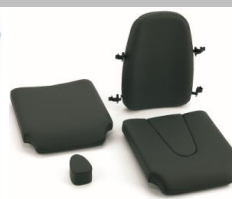
Comfort seat and back