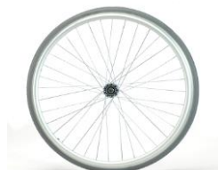
Mar rear heels