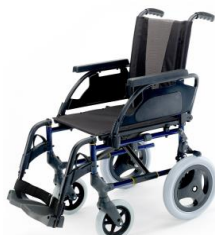
12" rear wheels