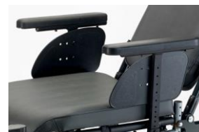
Single post armrests