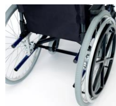
One arm drive