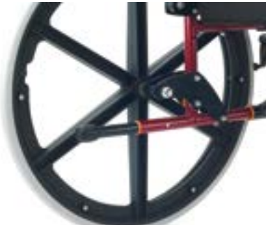
Double amputee kit