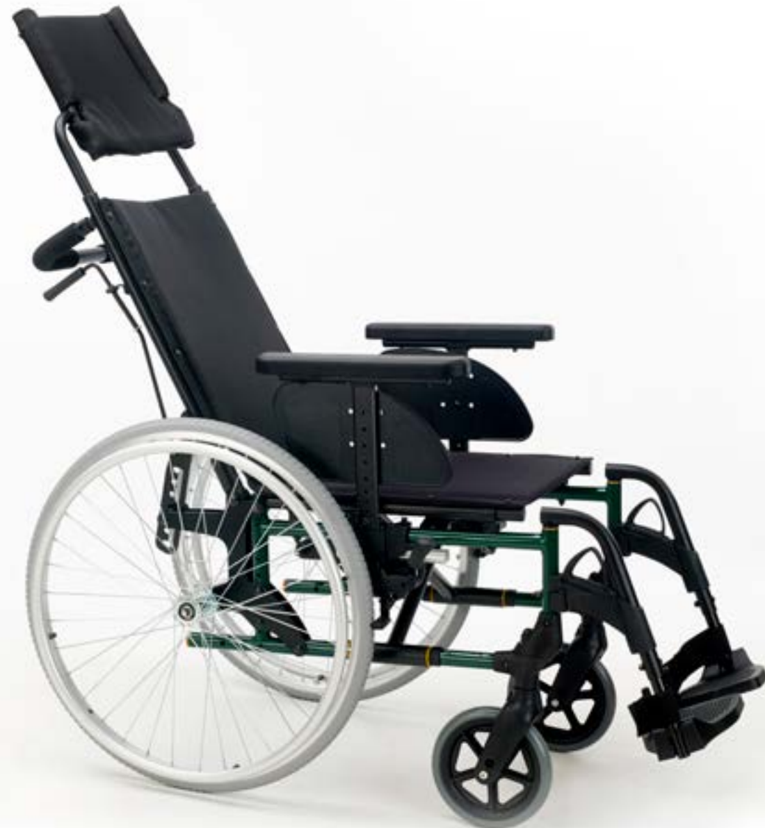
Standard configuration with upholstery recline headrest and (optional) detachable axles