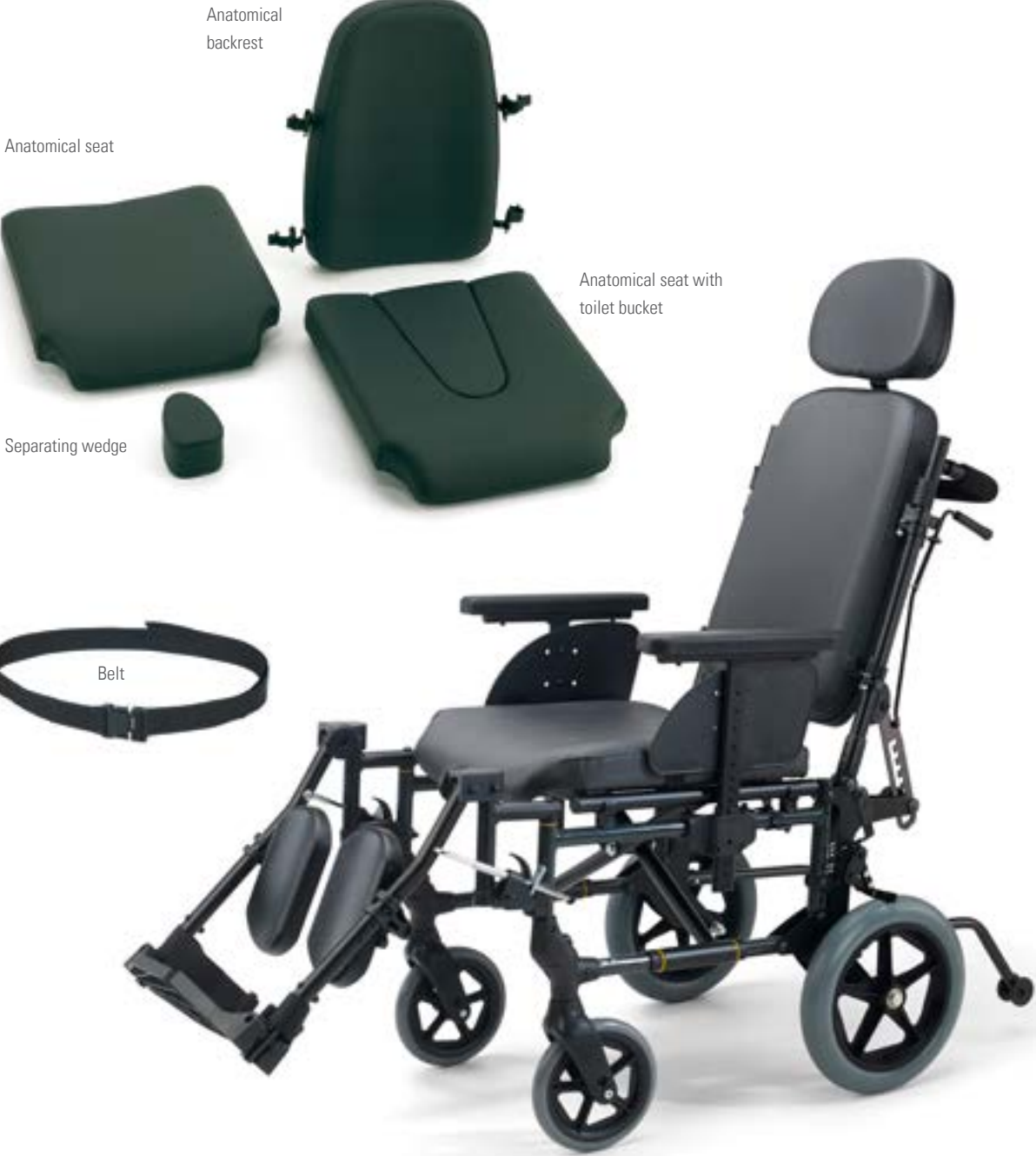
Breezy Premium model with reclining backrest and anatomical seat and backrest