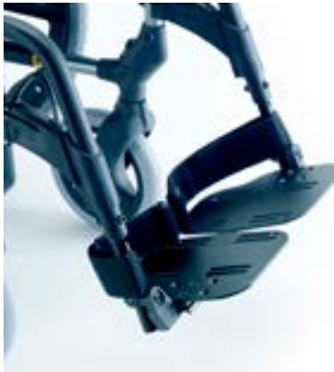
Aluminium angled adjustable footplates