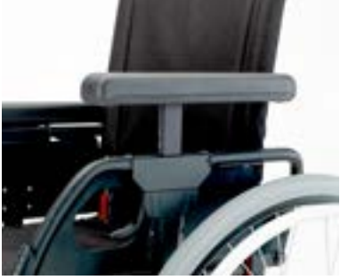
Height adjustable armrest