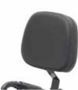
Sky headrest assembled on nylon upholstery