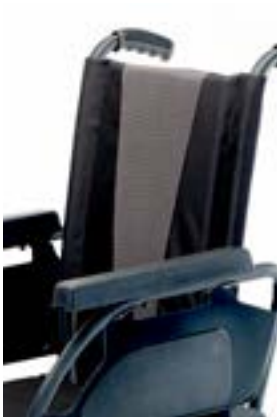
Breathable Vented upholstery