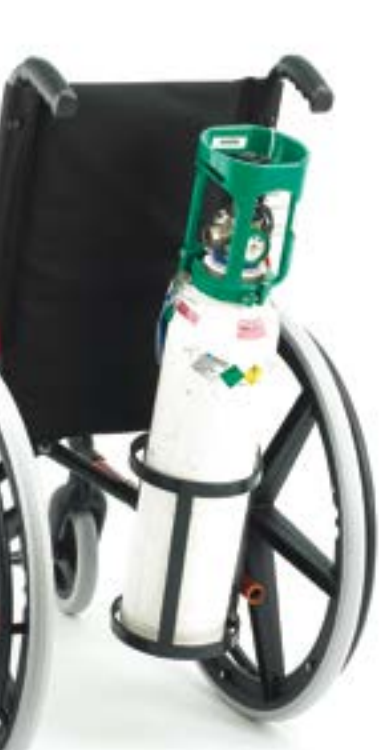
Oxygen bottle holder