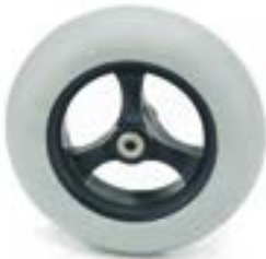
Slid front castors 8" x 2"