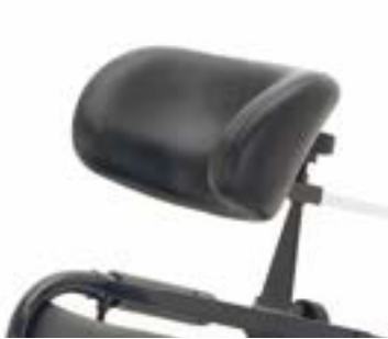
Anatomical headrest assembled on nylon upholstery