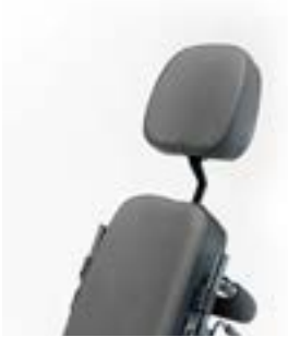
Sky headrest assembled on anatomical headrest