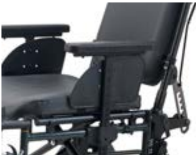
T armrests, height adjustable (with tools)