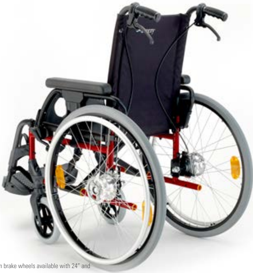
Drum brake wheels available with 24" and 12" rear wheels