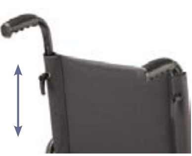
Height adjustable handles