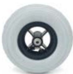
Pneumatic front castors 8" x 2"