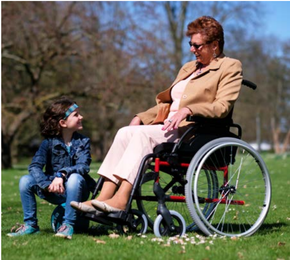
Breezy Premium folded