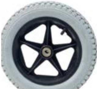
Solid or Pneumatic rear wheels 12"