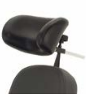
Anatomical headrest assembled on anatomical backrest