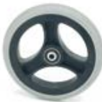
Slid front castors 6"