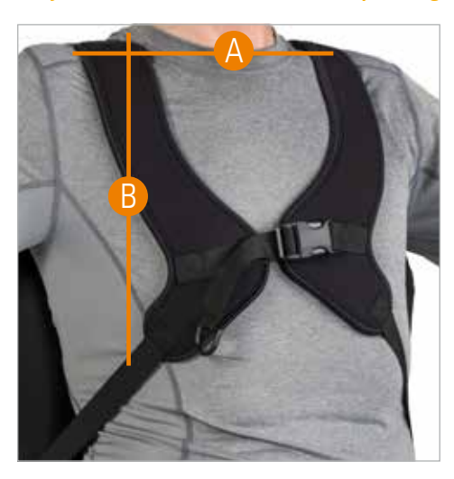
Adjustable Stretch, Centre-Opening

The Centre Opening allows for increased flexibility in frequent transfers and the adjustable centre strap allows for a more precise fit.