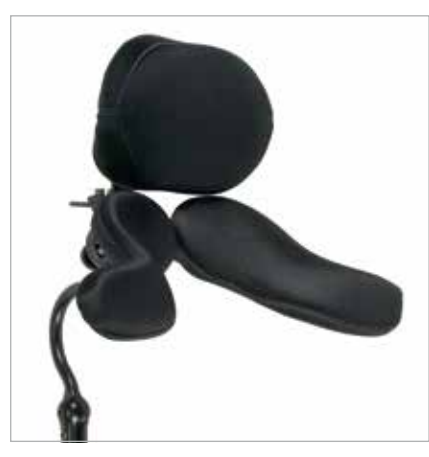
The S.O.F.T. Dual Sub-Occipital head support features a three-pad device for superior sub-occipital and proximal lateral cervical support and ensures maximum support surface contact.