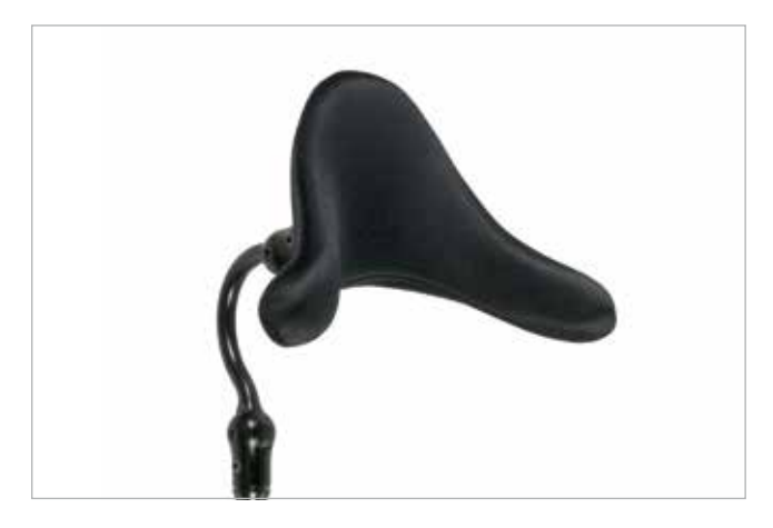
The Contoured Cradle head support is designed to cradle the occipital region and provides superior lateral cervical support.