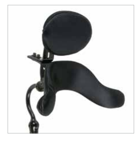
The S.O.F.T. Single Sub-Occipital head support provides outstanding sub-occipital and proximal lateral cervical support through use of a single curved sub-occipital pad.