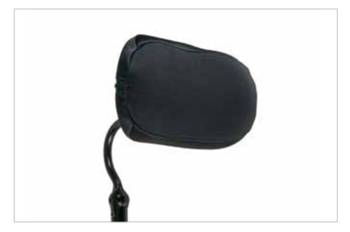
The Plush head support provides excellent posterior support with a high level of comfort and client safety.