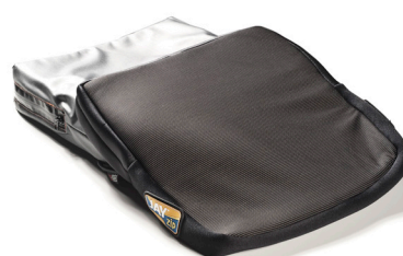
Outer and inner cover