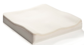
Dual layered contoured foam base