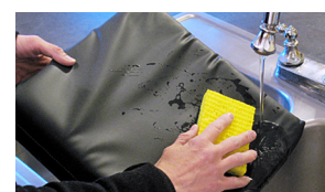
Easy washing and cleaning