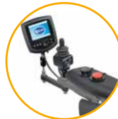
Same side as Omni