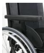
NSW040052 Single-post sideguard, armpad (330 mm)