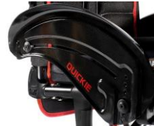
NSW040104 Carbon fibre, cold weather protection, fender