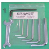
NSW090000 Tool kit