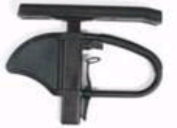
NSW040050 Single-post sideguard