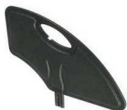
NSW040107 Sideguard, composite, removable (black)