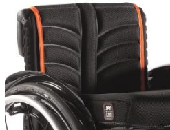
NSW030317 EXO PRO backrest sling