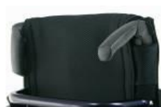
NSW030203 Push handles, fold-down