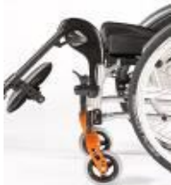
NSW050011 Hanger, aluminum, flip-up (0-90°), Swing-away