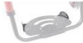
NSW050127 Adjustable side protection