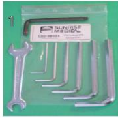
NSW090000 Tool kit