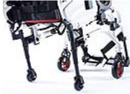
NSW090010 Transit wheels