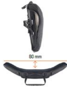
JAY J3 Back Mid Contour