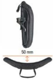
JAY J3 Back Shallow Contour