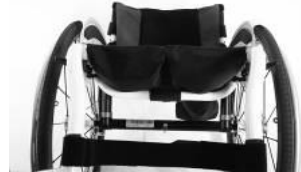
NSW020003 Seat sling with 2 utility bags