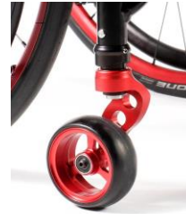
NSW080008 Castor fork, aluminum, one-arm, red