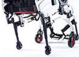
NSW090010 Transit wheels