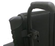
NSW030204 Push handles, height-adjustable