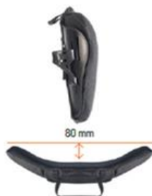
JAY J3 Back Mid Contour