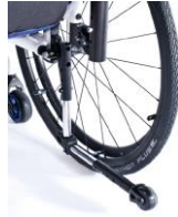
NSW090006 Anti-tip tubes, swing away