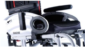
NSW04000x Desk sideguard, armpad, flip-up, removable