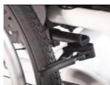
NSW060003 Compact brake