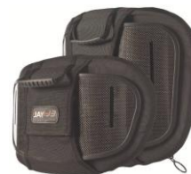
Jay 3 Carbon Back Shallow Contour