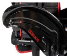
NSW040104 Carbon fibre, cold weather protection, fender