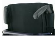
NSW030203 Push handles, fold-down