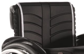
NSW030316 EXO backrest sling