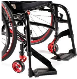
NSW050022 Footboard divided, aluminium, frame colour