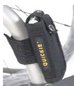
NSW090026 Mobile phone pocket