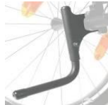
NSW090001 Tip assist