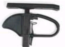
NSW040050 Single-post sideguard