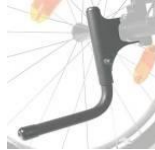
NSW090001 Tip assist