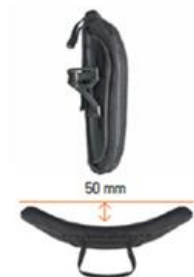
JAY J3 Back Shallow Contour