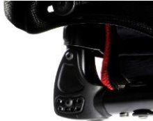
NSW030012 Backrest, angle adjustable