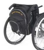
NSW090030 Back pack