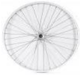
NSW070001 Universal wheel