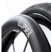
NSW070212 Handrims Ellipse 3R