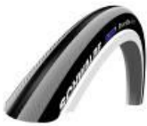
NSW070101 Schwalbe Right Run