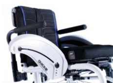
NSW040117 Tubular armrest, swing away, removable, padded