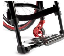
NSW050132 Footboard platform, lightweight, carbon fibre