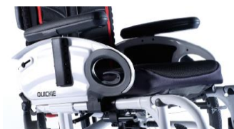
NSW04000x Desk sideguard, armpad, flip- up, removable