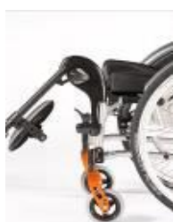
NSW050011 Hanger, aluminum, flip-up (0- 90°, Swing-away