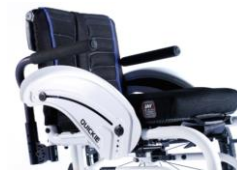
NSW040117 Tubular armrest, swing away, removable, padded