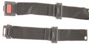
NSW090018 Lap belt with buckle, metal