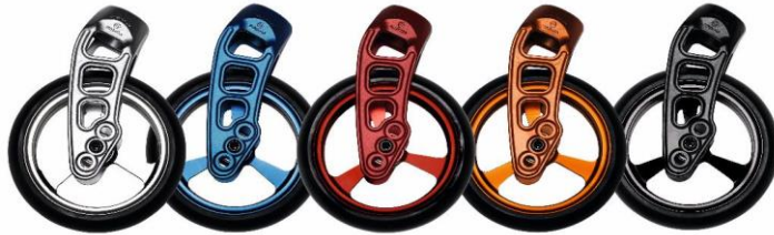
NSW080013 & NSW080306 Castor fork, Carbotecture & Castor solid (soft) aluminium