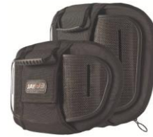
Jay 3 Carbon Back Shallow Contour