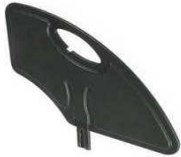
NSW040107 Sideguard, composite, removable (black)