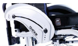
NSW040103 Aluminium, cold weather protection, fender