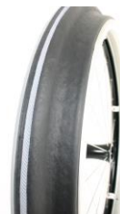
XES070208 Handrims Maxgrepp