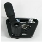
XES060001 Standard brake