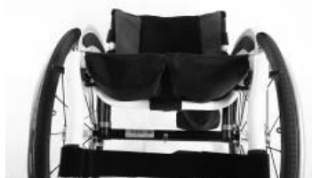
XES 020003 Seat sling with utility bags 2