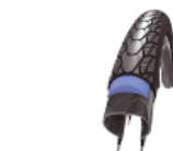
XES070104 Schwalbe Marathon Plus Evolution