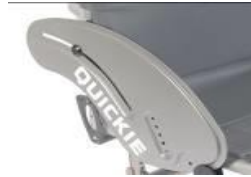
XES040102 Aluminium , cold weather protection