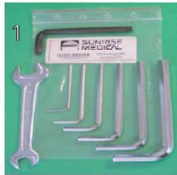
XES090000 Tool kit