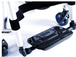
XES050132 Footboard platform, lightweight, carbon fibre