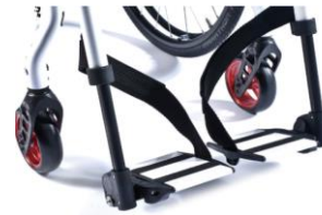
XES050022 Footboard divided, aluminium, frame colour