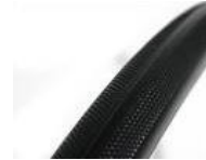
XES070102 Tyre, puncture proof