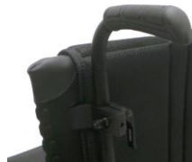
XES 030204 Push handles, height-adjustable