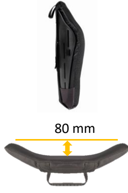
JAY J3 Mid Contour