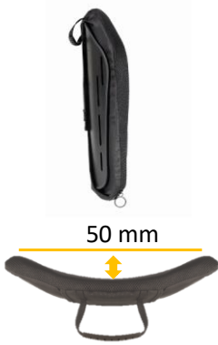
JAY J3 Shallow Contour