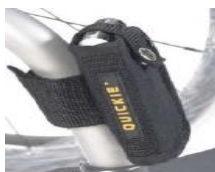
XES090026 Mobile phone pocket