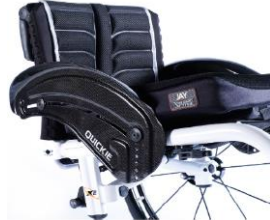
XES040104 Carbon fibre, cold weather protection, fender