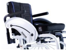
XES040117 Tubular armrest, swing away, removable, padded