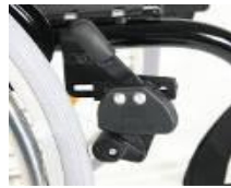
XES060002 Knee lever brake