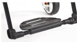
XES050059 Footboard platform, Performance