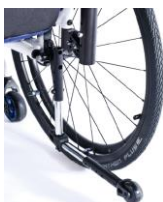
XES090004 Anti-tip tubes, swing away