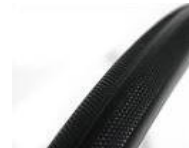
XES070102 Tyre, puncture proof