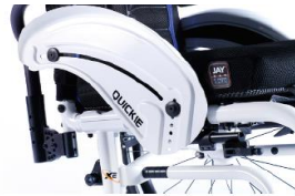
XES040103 Aluminium, cold weather protection, fender