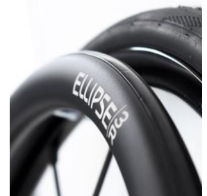
XES070212 Handrims Ellipse 3R