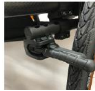
XES060023 Compact brake EVO