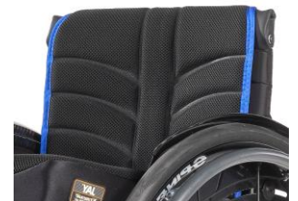
XES 030317 EXO PRO backrest sling (EXO Evo version)