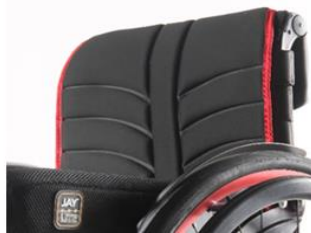
XES 030316 EXO backrest sling (EXO Evo version)