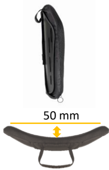
JAY J3 Shallow Contour