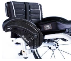
XES040104 Carbon fibre, cold weather protection, fender