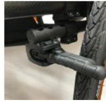
XES060023 Compact brake EVO