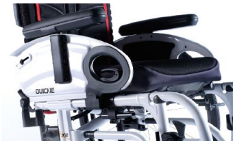
XES04000x Desk sideguard, armpad, flip- up, removable