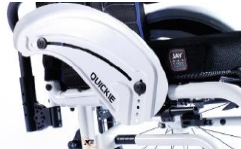
XES040103 Aluminium, cold weather protection, fender