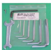
XES090000 Tool kit