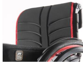
XES 030316 EXO backrest sling (EXO Evo version)