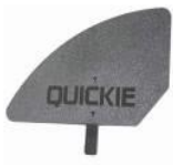
XES040107 Composite sideguard detachable