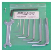
XES090000 Tool kit