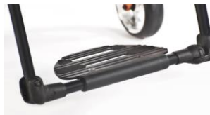
XES050059 Footboard platform, Performance