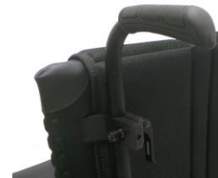
XES 030204 Push handles, height-adjustable