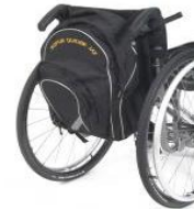
XES090030 Back pack