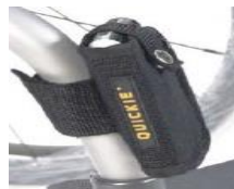
XES090026 Mobile phone pocket