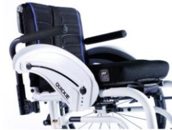
XES040117 Tubular armrest, swing away, removable, padded