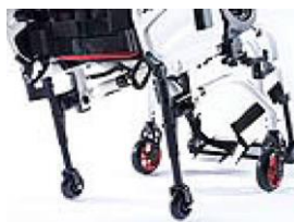
XES090010 Transit wheels