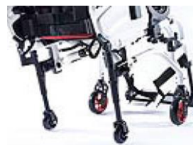
XES090010 Transit wheels