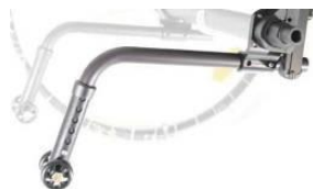
XES090050 Anti-tip tubes, plug in, pair