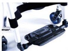
XES050132 Footboard platform, lightweight, carbon fibre