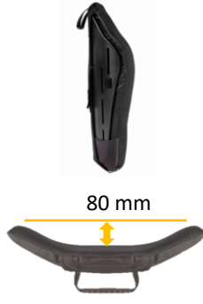
JAY J3 Mid Contour