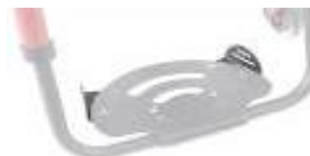
XES050127 Adjustable side protection