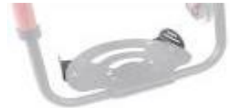
XES050127 Adjustable side protection