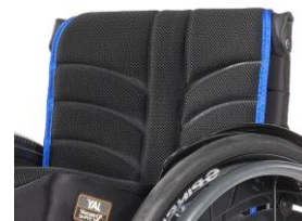
XES 030317 EXO PRO backrest sling (EXO Evo version)