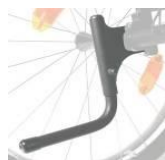
XES090001 Tip assist