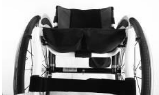
XES 020003 Seat sling with utility bags 2