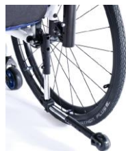
XES090004 Anti-tip tubes, swing away