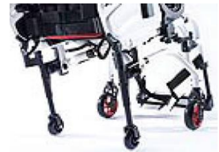
XES090010 Transit wheels