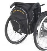
XES090030 Back pack