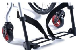
XES050022 Footboard divided, aluminium, frame colour