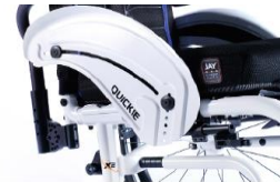
XFF040103 Aluminium, cold weather protection, fender