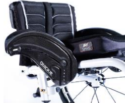
XFF040104 Carbon fibre, cold weather protection, fender