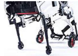
XFF090010 Transit wheels