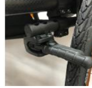
XFF060023 Compact brake EVO