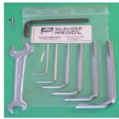
XFF090000 Tool kit