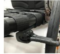
XFF060024 Lightweight compact brake EVO