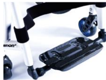
XFF050132 Footboard platform, lightweight, carbon fibre