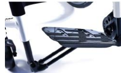
XFF050027 Footboard platform, lightweight, carbon fibre, auto folding