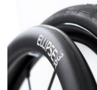
XFF070212 Handrims Ellipse 3R