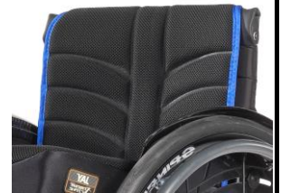
XFF 030317 EXO PRO backrest sling (EXO Evo version)