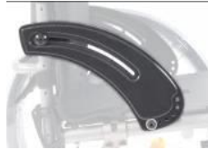
XFF040101 carbon fibre, cold weather protection, slim