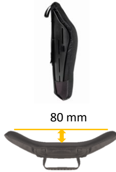
JAY J3 Mid Contour