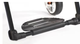
XFF050059 Footboard platform, performance