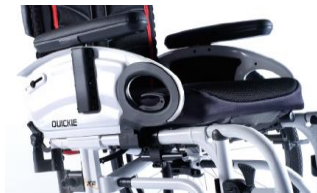
XFF04000x Desk sideguard, armpad, flip- up, removable