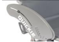
XFF040102 Aluminium, cold weather protection