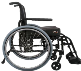
Quickie QXi, Ultra Lightweight Adjustable Folding Wheelchair