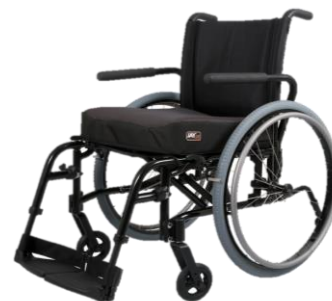
Quickie QXi featuring the Jay ION™ cushion