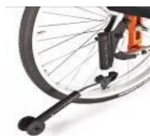
Anti-tip tubes, swing- away, left