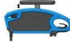
Desk sideguard, armpad, height-adjustable, flip-up, remove