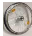
Rear wheel, drum brakes, 36 spokes, cross-wise spokes