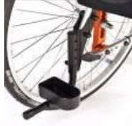
Crutch holder, loop