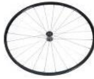
Rear wheel, Lightweight, 24 spokes, straight spokes