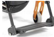
Footboard, platform, lightweight, plastic, angle & depth- adjustable flip up (sideways), calf strap, black