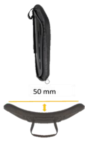
JAY J3 Back Shallow Contour