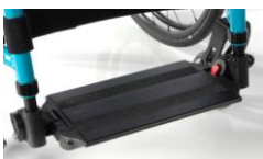
Footboard, angle and depth adjustable; flip up, aluminium with locking system