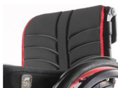
EXO backrest sling (EXO Evo version)