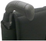
Push handles long