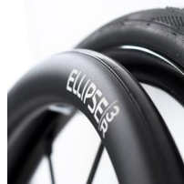
Ellipse 3R Handrim