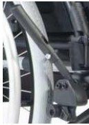
Push to lock brake, one- arm, right actuation