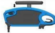
Desk sideguard, armpad, height-adjustable, flip-up, remove