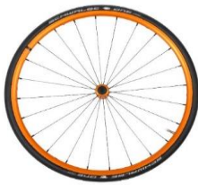
Lightweight wheel, anodized orange