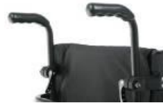
Push handles, height-adjustable