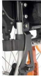
Backrest, angle adjustable