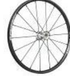
Rear wheel, Spinergy, 18 spokes (black), straight spokes; hub: silver