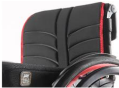
EXO backrest sling (EXO Evo version)