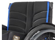
EXO PRO backrest sling (EXO Evo version)