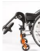
Elevating legrest (ELR)