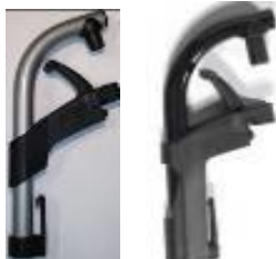
Composite hanger 110°/100°