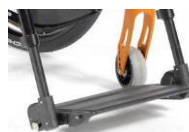
Footboard, platform, lightweight, plastic, angle & depth- adjustable flip up (sideways), calf strap, black