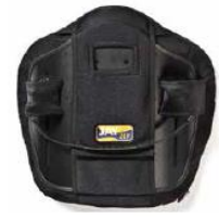
Jay Zip Back