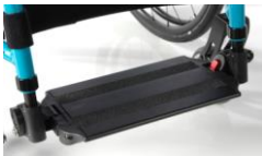
Footboard, angle and depth adjustable; flip up, aluminium with locking system