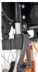
Backrest, angle adjustable