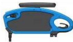
Desk sideguard, armpad, fixed, flip-up, remove