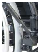
Push to lock brake, one- arm, right actuation