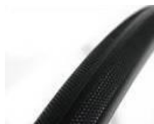
Tyre, puncture proof, tread