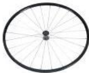
Rear wheel, Lightweight, 24 spokes, straight spokes