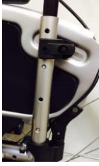
Backrest tube, aluminum