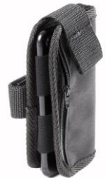
Mobile phone pocket