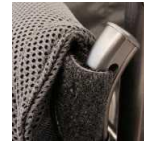
Without push handles,