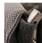
Without push handles,