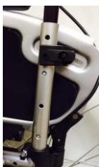
Backrest tube, aluminum