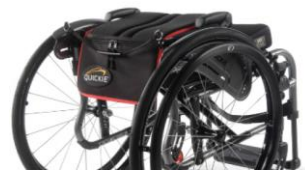
Backrest, fold down (to the front)