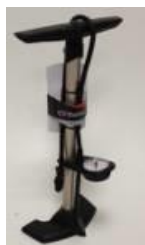
High pressure pump