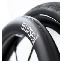
Ellipse 3R Handrim