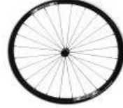
Rear wheel, Proton, 24 spokes, straight spokes