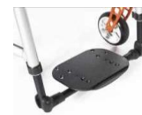
Footboard, platform, lightweight, plastic, angle & depth-adjustable flip up (sideways), calf strap