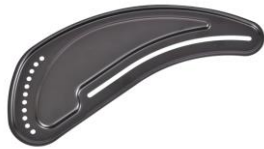
Aluminium sideguard, wet weatherprotection (in frame colour)