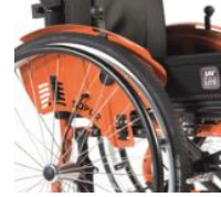
Push to lock brake, integrated in sideguard, Safari