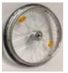
Rear wheel, drum brakes, 36 spokes, cross- wise spokes