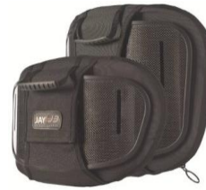
Jay 3 Carbon Back Shallow Contour