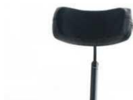
Headrest, height, depth and angle adjustable