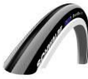
Tyre, pneumatic, fine profile, Schwalbe Right Run