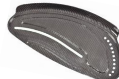
Carbon fibre sideguard, fender, wet weatherprotection (black)