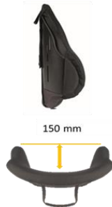
JAY J3 Back Mid Deep Contour