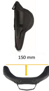
JAY J3 Back Deep Contour