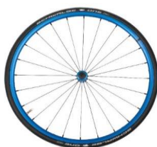
Lightweight wheel, anodized blue