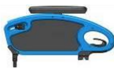
Desk sideguard, armpad, fixed, flip-up, remove