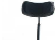
Headrest, height, depth and angle adjustable