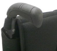
Push handles long