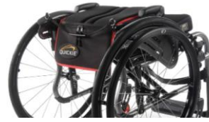
Backrest, fold down (to the front)