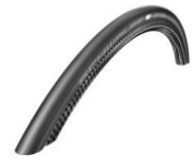
Tyre, pneumatic, slick, Schwalbe One