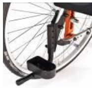
Crutch holder, loop