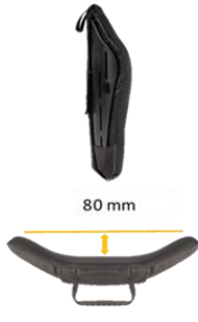
JAY J3 Back Mid Contour