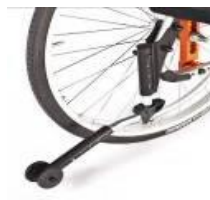
Anti-tip tubes, swing- away, left