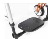
Footboard, platform, lightweight, plastic, angle & depth-adjustable flip up (sideways), calf strap