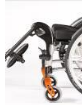
Elevating legrest (ELR)