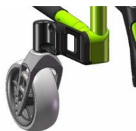
Expansion kit, designed for hemiplegic users