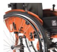
Push to lock brake, integrated in sideguard, Safari