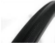
Tyre, puncture proof, tread