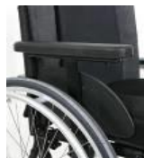
Single-post sideguard, armpad, height-adjustable, remove