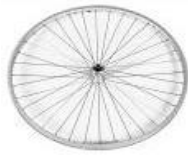
Rear wheel, Design, 36 spokes, straight spokes