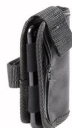
Mobile phone pocket