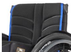
EXO PRO backrest sling (EXO Evo version)