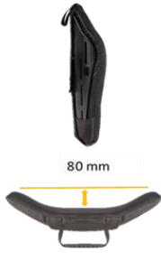
JAY J3 Back Shallow Contour