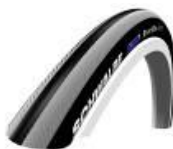
Tyre, pneumatic, fine profile, Schwalbe Right Run