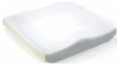
Jay Basic (picture shown without upholstery)