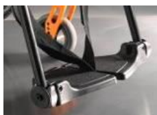
Divided footplate composite