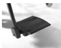
Divided footplate aluminum