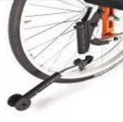
Anti-tip swing away