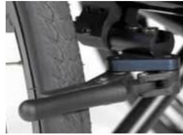
Compact wheel lock