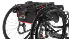
Backrest, fold down (to the front)