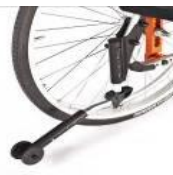
Anti-tip swing away