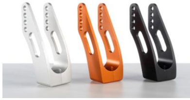
Fork Aluminium, black, orange & silver