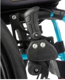
Knee lever wheel lock