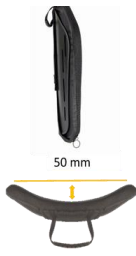
JAY J3 Back Shallow Contour