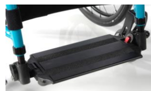
Platform, angle and depth adjustable; flip up, aluminium with locking system