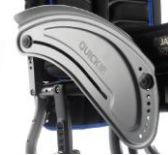
Sideguard alu with fender