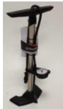
High pressure pump