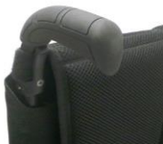
Push handles long