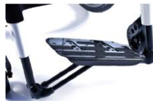
Footboard platform, lightweight, carbon fibre, auto folding