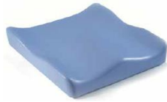
Jay Soft Combi P (picture shown without upholstery)