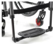
Platform footplate lightweight angle & depth adjustable composite flip up