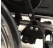
One arm wheel lock