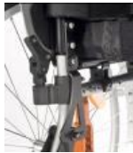
Angle adjustable back -12° to 12°