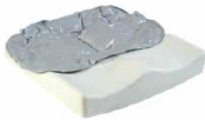
Jay Easy Fluid (picture shown without upholstery)