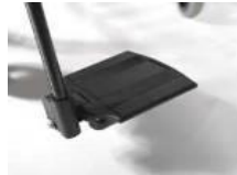
Divided footplate aluminum