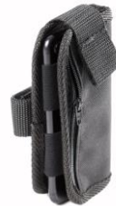
Mobile phone pocket