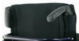
Fold down push