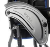
Sideguard alu with fender