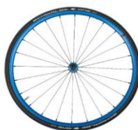
Lightweight wheel, anodized blue