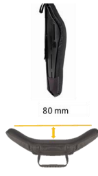
JAY J3 Back Mid Contour