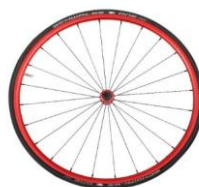
Lightweight wheel, anodized red