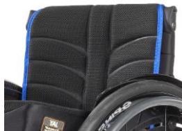
EXO PRO backrest sling (EXO Evo version)