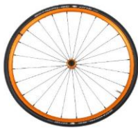
Lightweight wheel, anodized orange