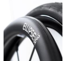
Ellipse 3R Handrim