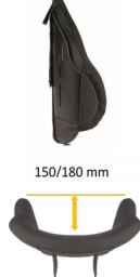
JAY J3 Back Mid Deep Contour