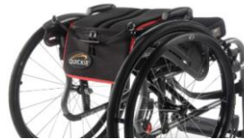
Backrest, fold down (to the front)