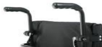
Height adjustable push handles