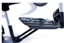
Footboard platform, lightweight, carbon fibre, auto folding