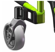
Expansion kit, designed for hemiplegic users