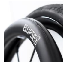
Ellipse 3R Handrim