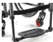
Platform footplate lightweight angle & depth adjustable composite flip up