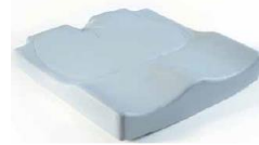
Jay Easy Visco (picture shown without upholstery)