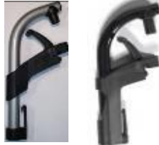
Composite hanger 70°/80°