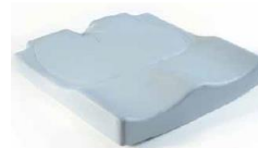
Jay Easy Visco (picture shown without upholstery)