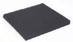
Seat cushion, cover with zipper, black