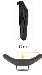
JAY J3 Back Mid Contour