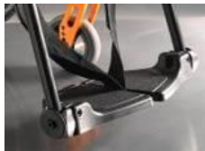
Divided footplate composite