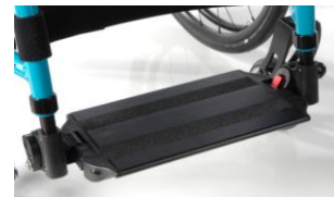
Platform, angle and depth adjustable; flip up, aluminium with locking system