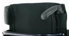
Fold down push