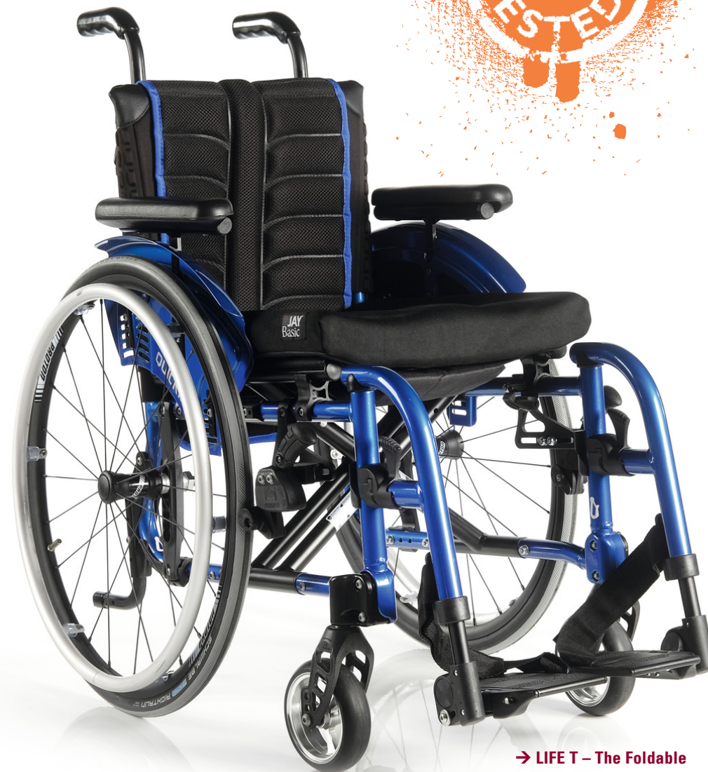
→ LIFE T – The Foldable