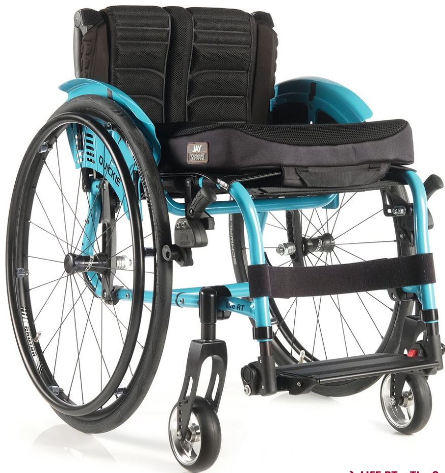
→ LIFE RT – The Sporty