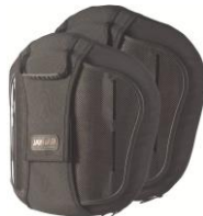
Mid Thoracic (MT)