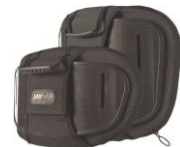
Lower Thoracic (LT)