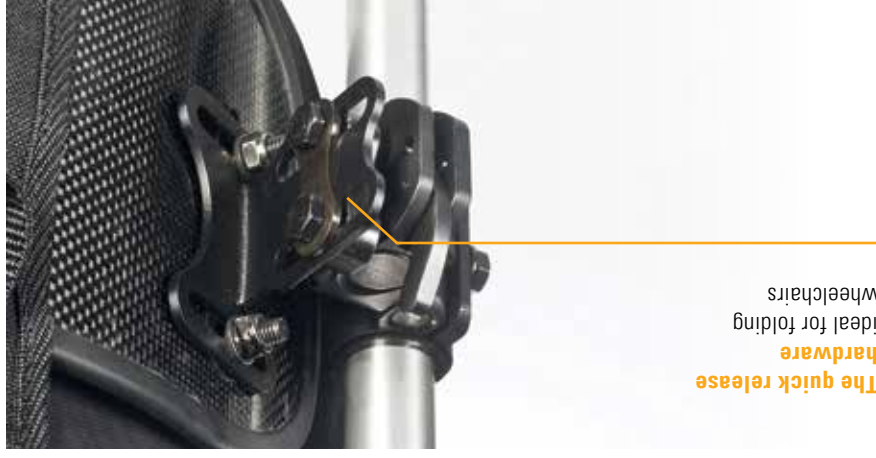
The quick release hardware ideal for folding wheelchairs

The J3 Carbon back is available with two different mounting systems. The fixed system offers rigid wheelchair users a mounting option that's extremely weight optimised. Alternatively, the quick-release system allows the backrest to be easily removed, ideal for mounting on a folding wheelchair. Regardless of choice, both mounting systems are designed as easy-to-handle, 2-point mounting systems and offer the same adjustments in angle, depth, height and width to help adapt the J3 Carbon back to your individual needs..