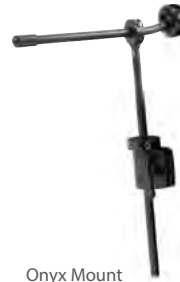
Onyx Mount Available with fixed, detachable or detachable w/offset vertical bar bracket. Adjustable at vertical/horizontal rod interface.