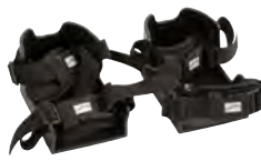
Shoe Holders ABS Shown. Also available with Tendon Relief and/or padded straps.