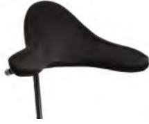
Contoured Cradle Pad Single layer of foam with contoured, curved base. Available in pediatric, small, medium and large sizes.