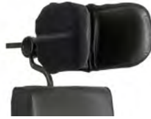
Adjust-A-Plush Pad Lateral opening adjusts at two tapered locking joints under zippered cover. Available in Standard or Narrow widths.