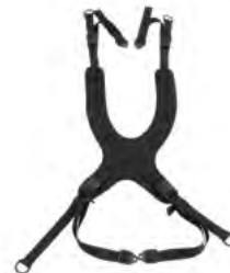
Anterior Trunk Supports Classic Comfortit shown. Also available with Con- tour Comfortit. Both available in structured or dynamic style