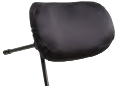
Plush Pad Dual-density foam with contoured, curved base. Available in 6", 8", 10", 14" or 19" widths.