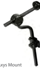
Axys Mount Available with detachable bracket only. Adjustable at vertical/horizontal rod interface.