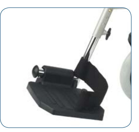
Practical leg length adjustment system with knob. Footrest with composite folding footplates and heel loop.