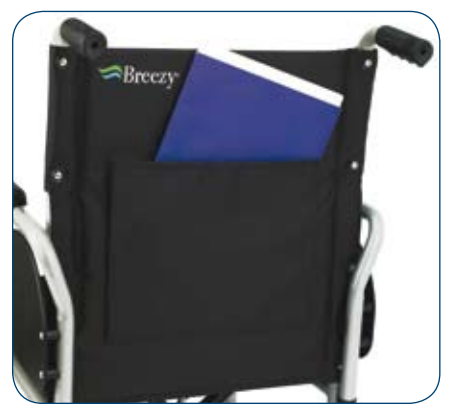
Nylon backrest covers the back tubes for increased confort, with rear pocket.