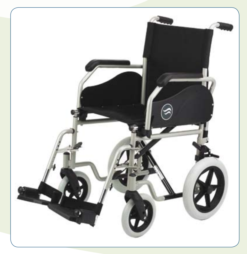
Breezy 90 with 12" rear wheels.

Just select the size of the rear wheel and seat width to determine the model of your Breezy 90.