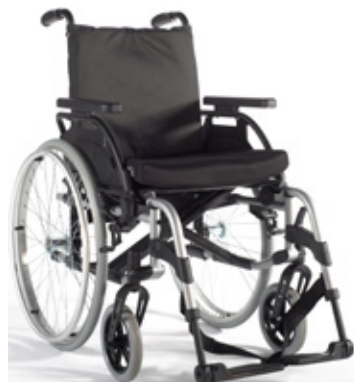
Quickie LX SE