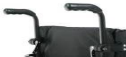
Height adjustable push handles