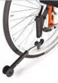
Anti-tip swing away