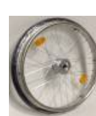
Drum brake wheel