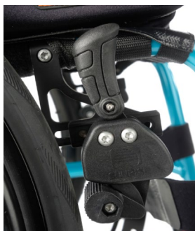
Knee lever wheel lock