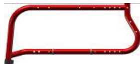
Life FF 85°