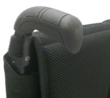
Push handles long