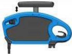
Desk armrest, height adjustable, short armpad(25cm)