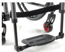
Platform footplate lightweight angle & depth adjustable composite flip up