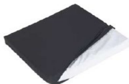
Seat cushion, climate membrane water-resistant, cover with zipper, black