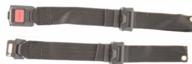
Lap belt with buckle, metal