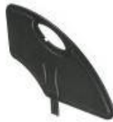
Sideguard composite detachable