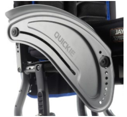
Sideguard alu with fender