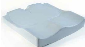
Jay Easy Visco (picture shown without upholstery)