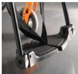
Divided footplate composite