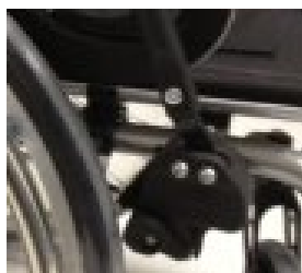
One arm wheel lock