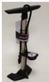
High pressure pump