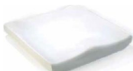
Jay Basic (picture shown without upholstery)