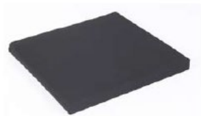
Seat cushion, cover with zipper, black