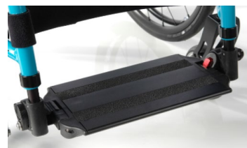
Platform, angle and depth adjustable; flip up, aluminium with locking system