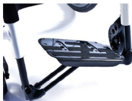
Footboard platform, lightweight, carbon fibre, auto folding