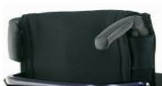
Fold down push