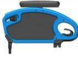
Desk armrest, fixed height, short armpad(25cm)