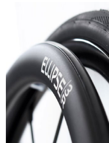
Ellipse 3R Handrim