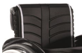
EXO backrest sling