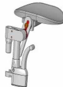
Amputee Support Pad