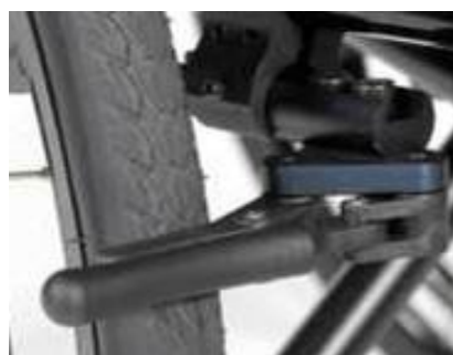
Compact wheel lock