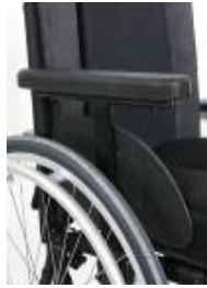
Single-post sideguard, depth adjustable, tool height-adjustable