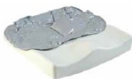
Jay Easy Fluid (picture shown without upholstery)