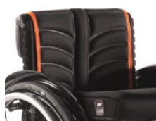
EXO PRO backrest sling