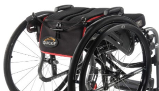
Backrest, fold down (to the front)