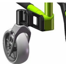
Expansion kit, designed for hemiplegic users