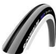
Right Run Tyre