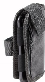
Mobile phone pocket