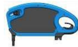
Desk armrest without armpad