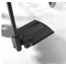
Divided footplate aluminum